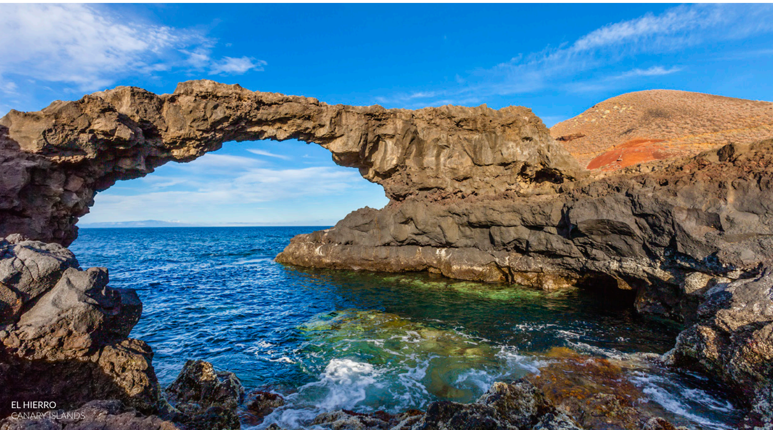
EL HIERRO CANARY ISLANDS

Some of the most fascinating places in Spain have adopted good practices which comply with the requirements for environmental, social and economic preservation. These are destinations which make responsible use of natural and cultural resources, while supporting local craftsmen and products.