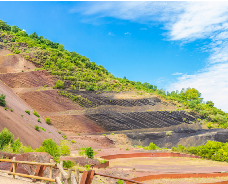
▲ CROSCAT VOLCANO GIRONA