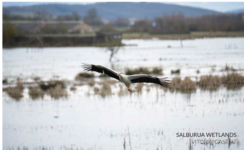
SALBURUA WETLANDS VITORIA-GASTEIZ

The results from this initiative are self-evident in places like the Salburua Wetlands , a breeding ground for numerous species of birds. Learn about the area's biodiversity in Ataria , a highly