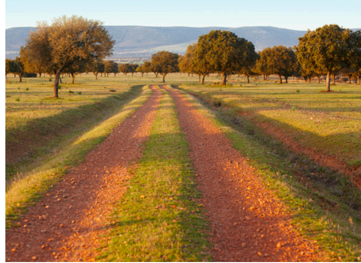
▲ CABAÑEROS NATIONAL PARK TOLEDO