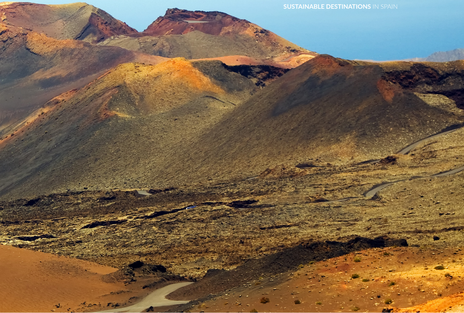
▲ TIMANFAYA NATIONAL PARK LANZAROTE