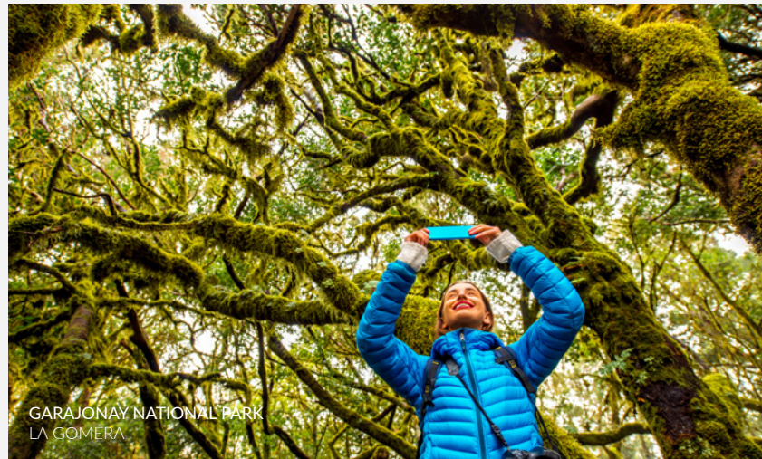
GARAJONAY NATIONAL PARK LA GOMERA

Small in size but with so many attractions. That is how you'll find La Gomera , a Biosphere Reserve in the Canary Islands. It's like a garden with valleys full of palm trees, enormous ravines, a coastline ideal for diving and forests of an intense green. Explore the island on foot and visit the Garajonay National Park , a UNESCO World Heritage Site. This wonderfully preserved subtropical laurel forest is unique in the world and represents half the extension of this type of forest in the whole archipelago.