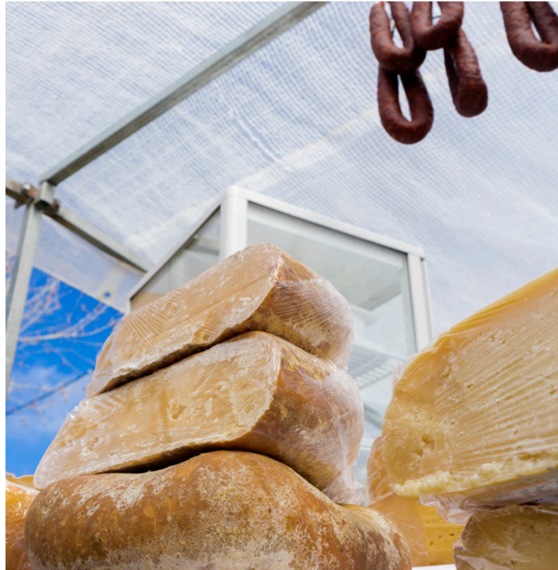
▲ MAHÓN CHEESE MENORCA

Culture and the preservation of traditional handicrafts are also an important part of ecotourism. Explore the Mediterranean countryside as you visit wine-cellar and oil mills, where wines and oils of the highest quality are produced, as well as ancient farm estates where they still manufacture delicious local honey, cold-meat products and honey.