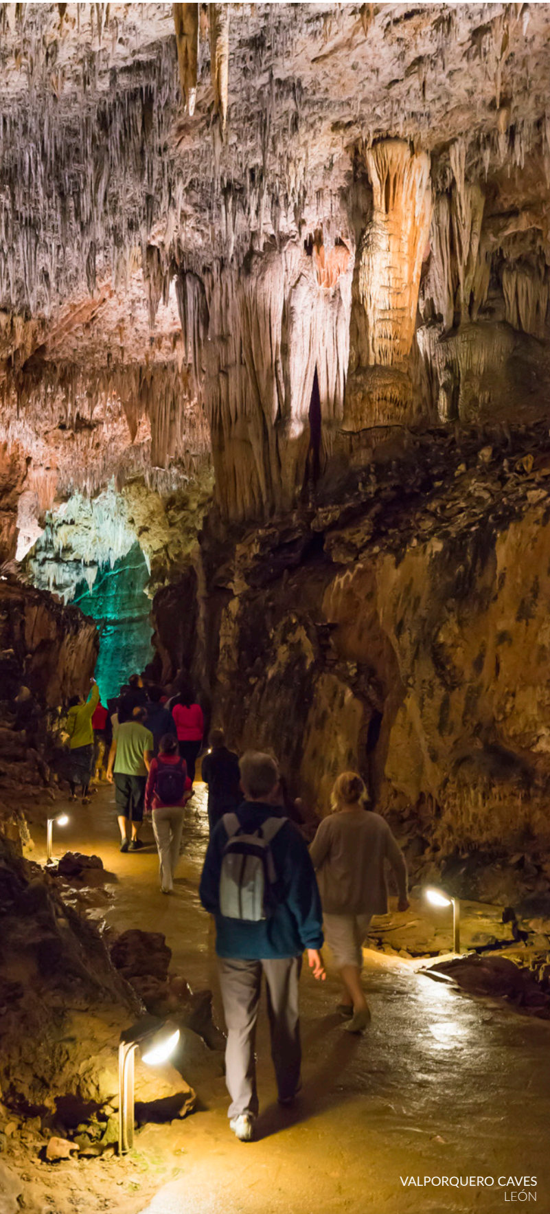
VALPORQUERO CAVES LEÓN