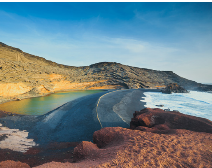
▲ CHARCO DE LOS CLICOS LANZAROTE

Discover the relationship between the inhabitants and their unique natural environment and explore the footprint left by the architect César Manrique on the island and the significance of his ecological message. Most of his works are to be found in Lanzarote, including the renowned César Manrique Foundation . Discover the perfect harmony between art and the landscape, where respect for the environment is what is most important..