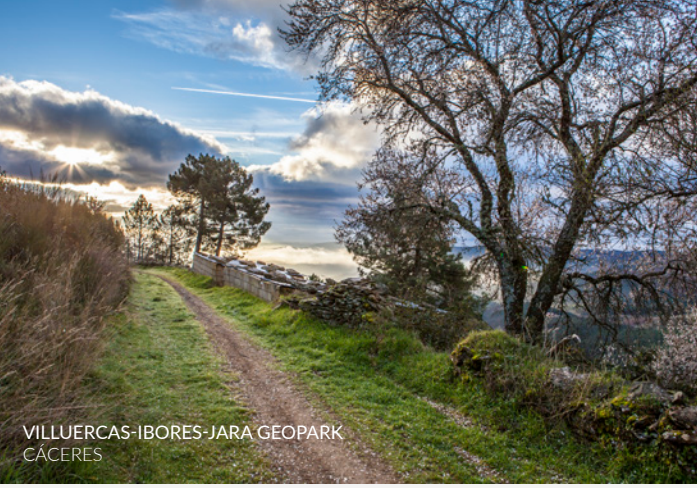
VILLUERCAS-IBORES-JARA GEOPARK CÁCERES