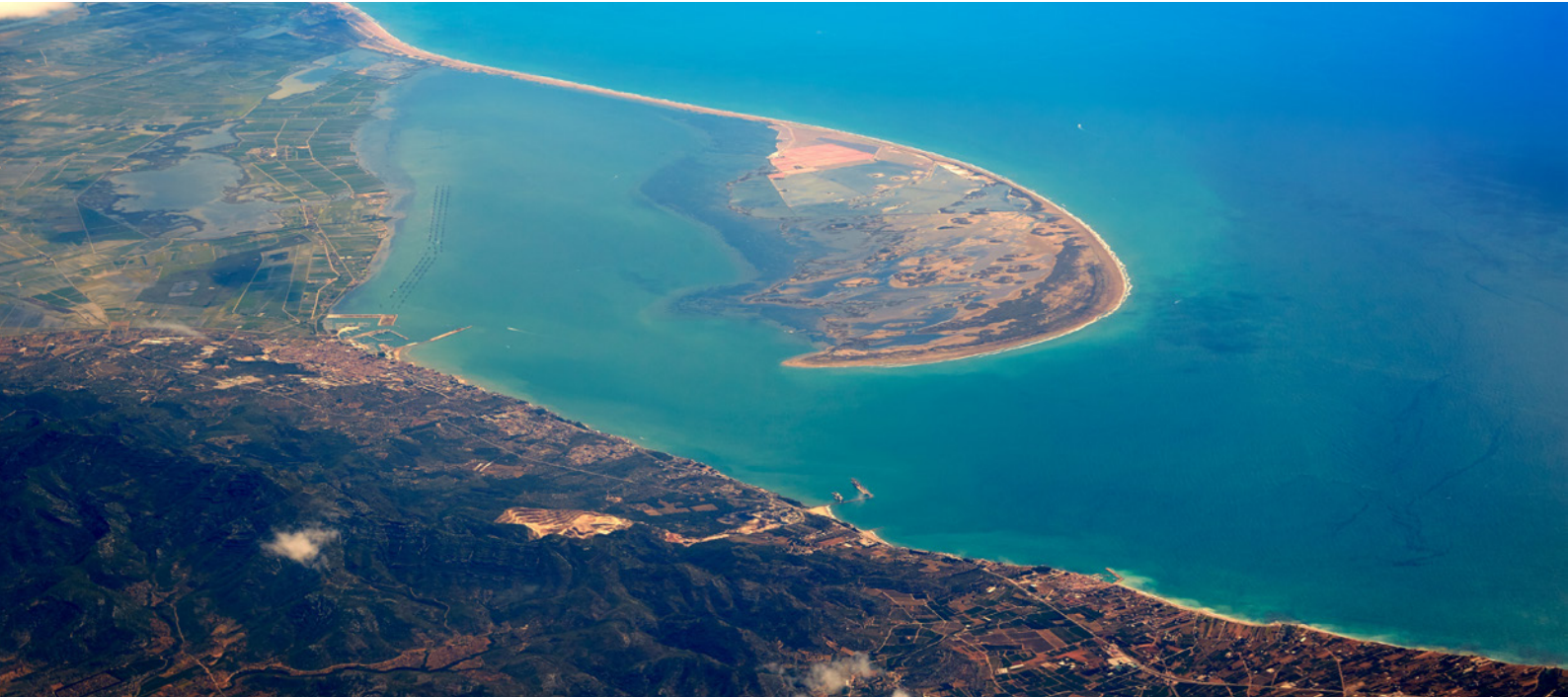
▲ DELTA DEL EBRO NATURE RESERVE TARRAGONA

The largest wetland in Catalonia harbours a wealth of natural features, as well as incredible landscapes and idyllic beaches. Take a walk through the park's rice fields at sunset, explore the maritime fluvial island of Buda by bicycle or take a kayak to discover the delights of such a special place as this.