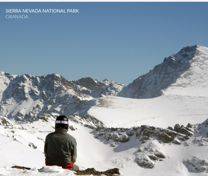
SIERRA NEVADA NATIONAL PARK GRANADA

In Spain there are so many areas where nature and its preservation are a prominent feature that it is really difficult to choose. Here are just a few of them, with different ecosystems and places of interest.