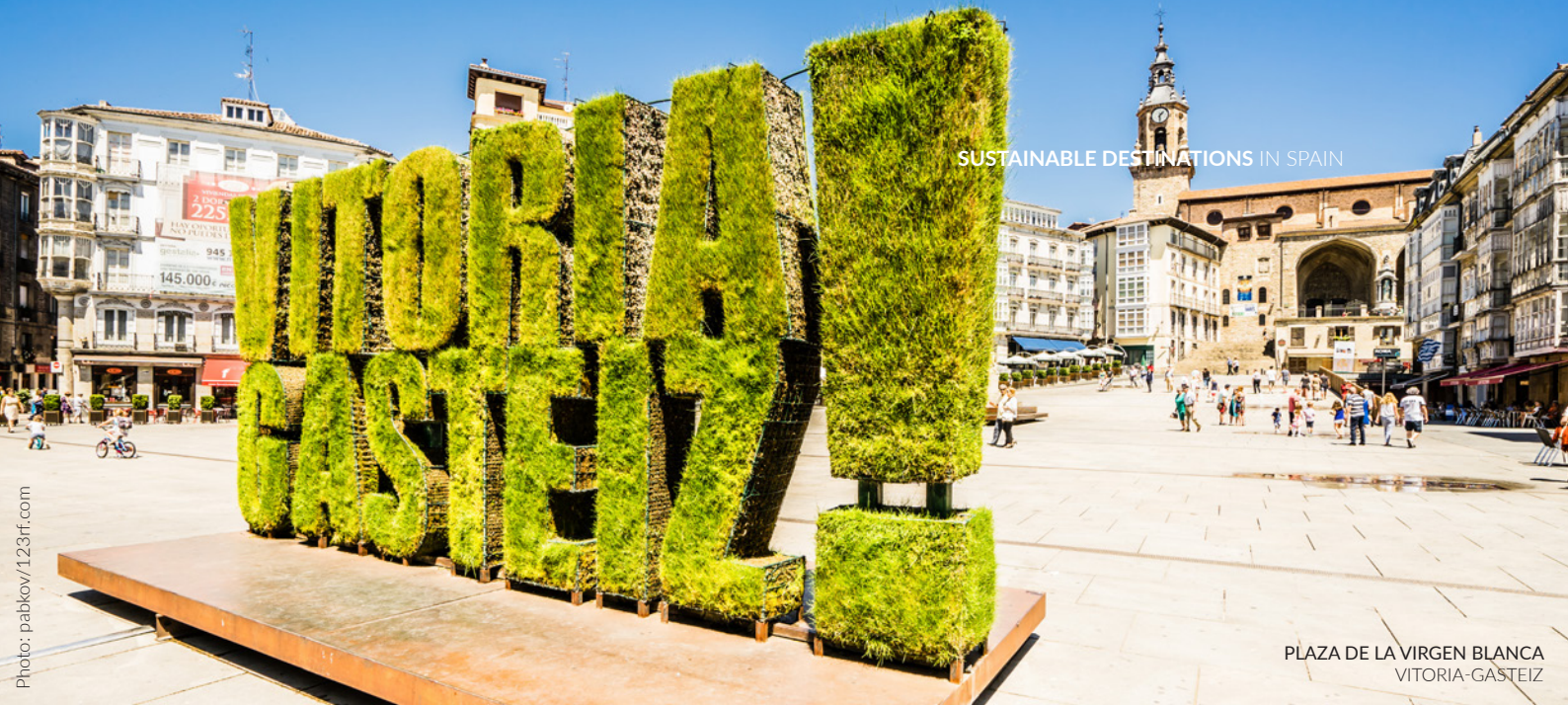
PLAZA DE LA VIRGEN BLANCA VITORIA-GASTEIZ