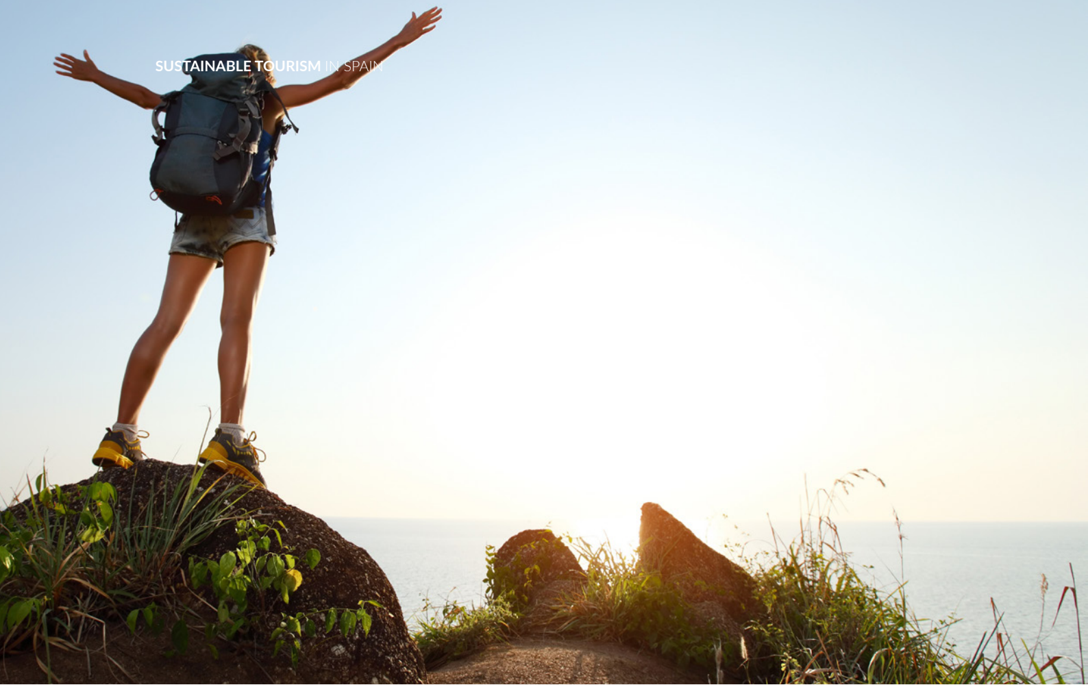
▲ ATLANTIC ISLANDS NATIONAL PARK GALICIA

Spain is top of the list in Europe, with 44 Protected Natural Areas which comply with the European Charter for Sustainable Tourism (ECST) , where protection of the natural environment is essential. In addition to the implementation of different environmental management systems in accordance with UNE-EN ISO 14001, Ecolabel and EMAS requirements, many public companies and administrations are promoting tourism which respects the environment.