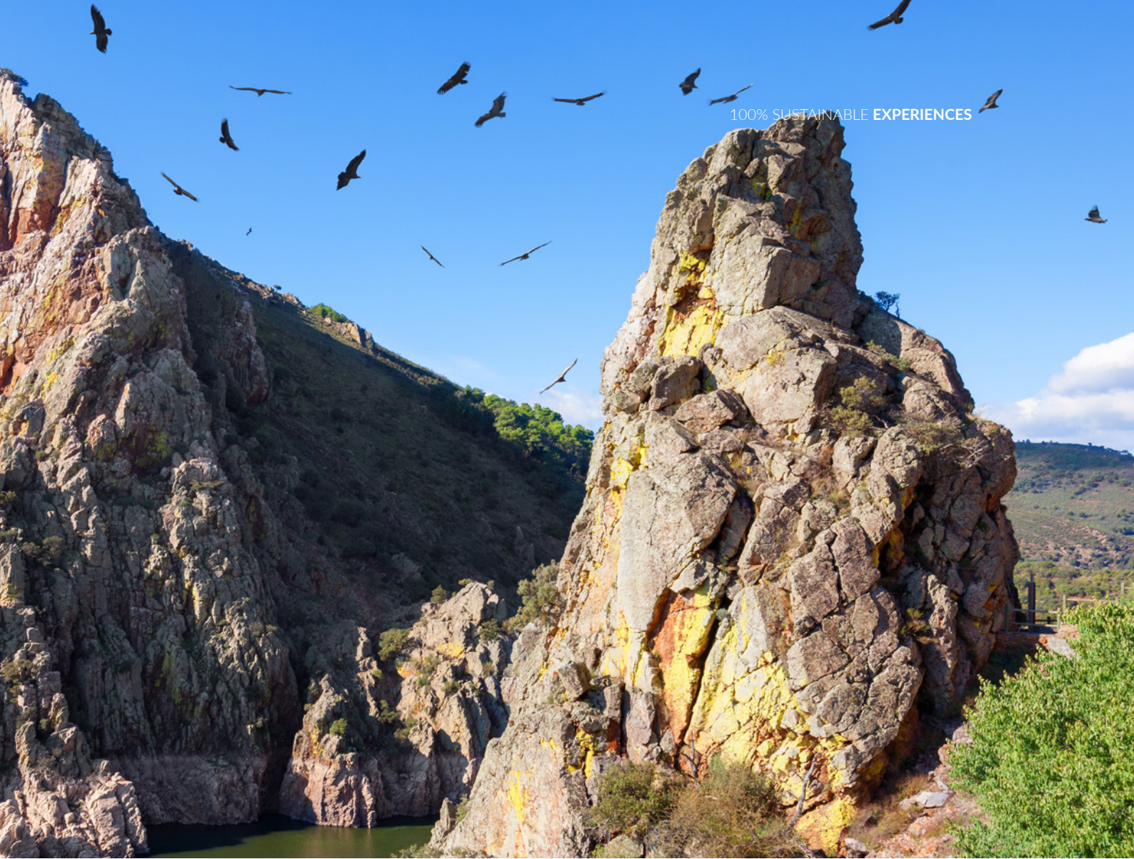
▲ COLONY OF BLACK VULTURES IN MONFRAGÜE EXTREMADURA

on the migratory route for thousands of birds like the spoonbill and the curlew. In the region there are still numerous "tidal mills", a renewable energy technology which was formerly used to take advantage of tidal power.