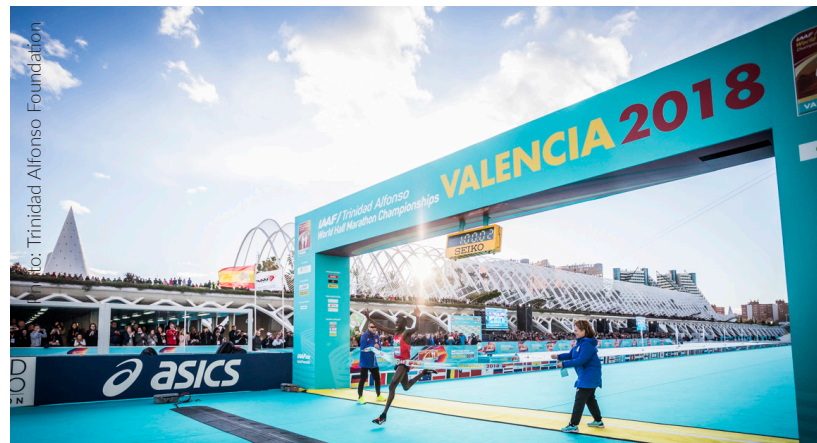
▲ IAAF 2018 WORLD HALF MARATHON CHAMPIONSHIP VALENCIA

Do you like running in good weather, near the sea and with an appreciative crowd watching? The circuit in Valencia is absolutely flat and next to the avant-garde City of Arts and Sciences , with a temperature of between 17 and 22°C and excellent organisation. It must have something if the IAAF (International Association of Athletics Federations) has awarded the Gold Label classification to both the marathon and the half marathon. The spectacular finish line is located on a gangway over the water next to the Umbracle and the Príncipe Felipe Museum.