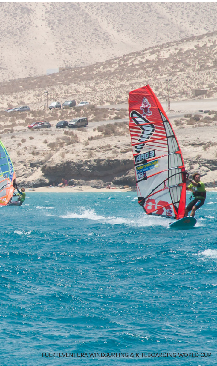
FUERTEVENTURA WINDSURFING &amp; KITEBOARDING WORLD CUP