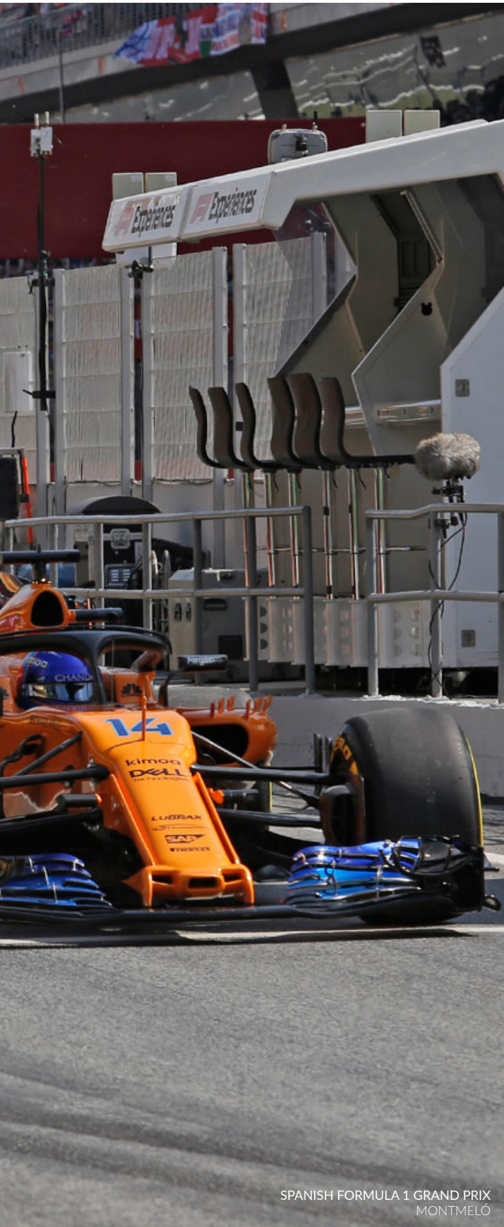
SPANISH FORMULA 1 GRAND PRIX MONTMELÓ