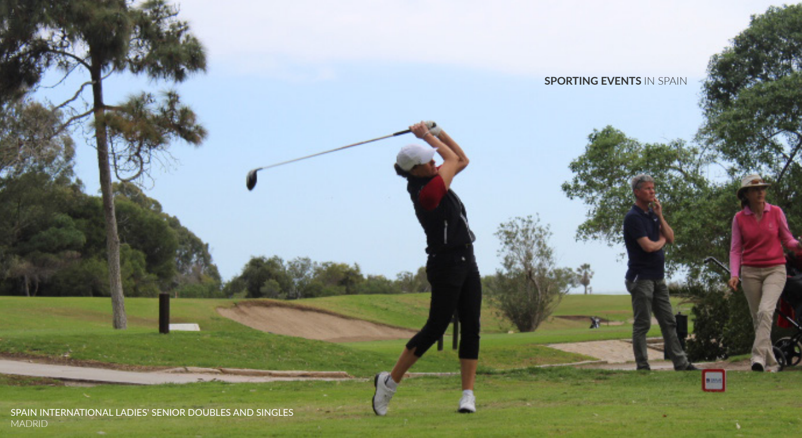
SPAIN INTERNATIONAL LADIES' SENIOR DOUBLES AND SINGLES MADRID