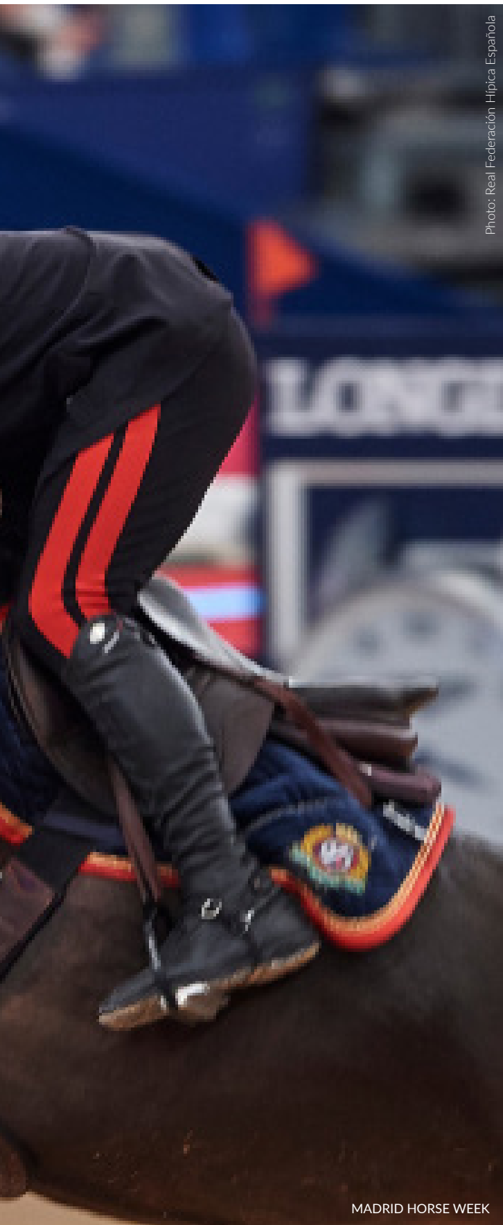
MADRID HORSE WEEK