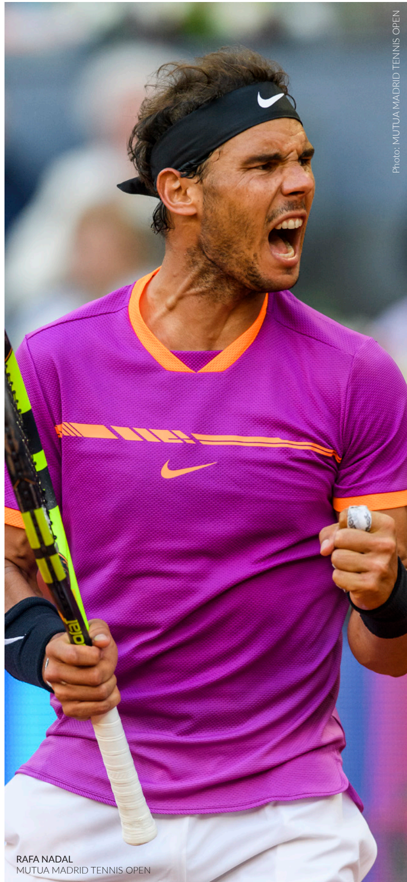
RAFA NADAL MUTUA MADRID TENNIS OPEN

Apart from a large shopping centre where you'll find the most prominent Spanish and international brands, you can also take part in a virtual tennis tournament which attracts more and more players each year. The winner of this tournament gets to meet the winners of the Madrid Open face-to-face.