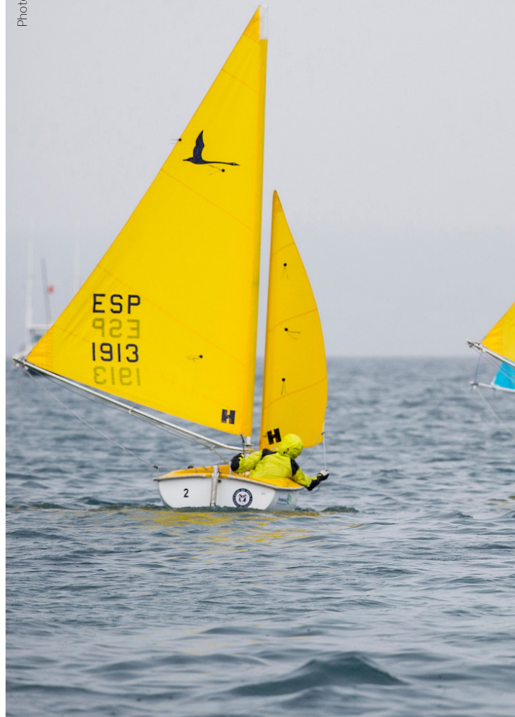
▲ PALMAVELA REGATTA BALEARIC ISLANDS

The Real Club Náutico de Palma de Mallorca is the main headquarters for this competition in which the main attraction are the really big yachts, but you'll also see some speedy, light carbon fibre boats, extraordinary classic yachts, agile one-design yachts and thrilling regattas in real time.