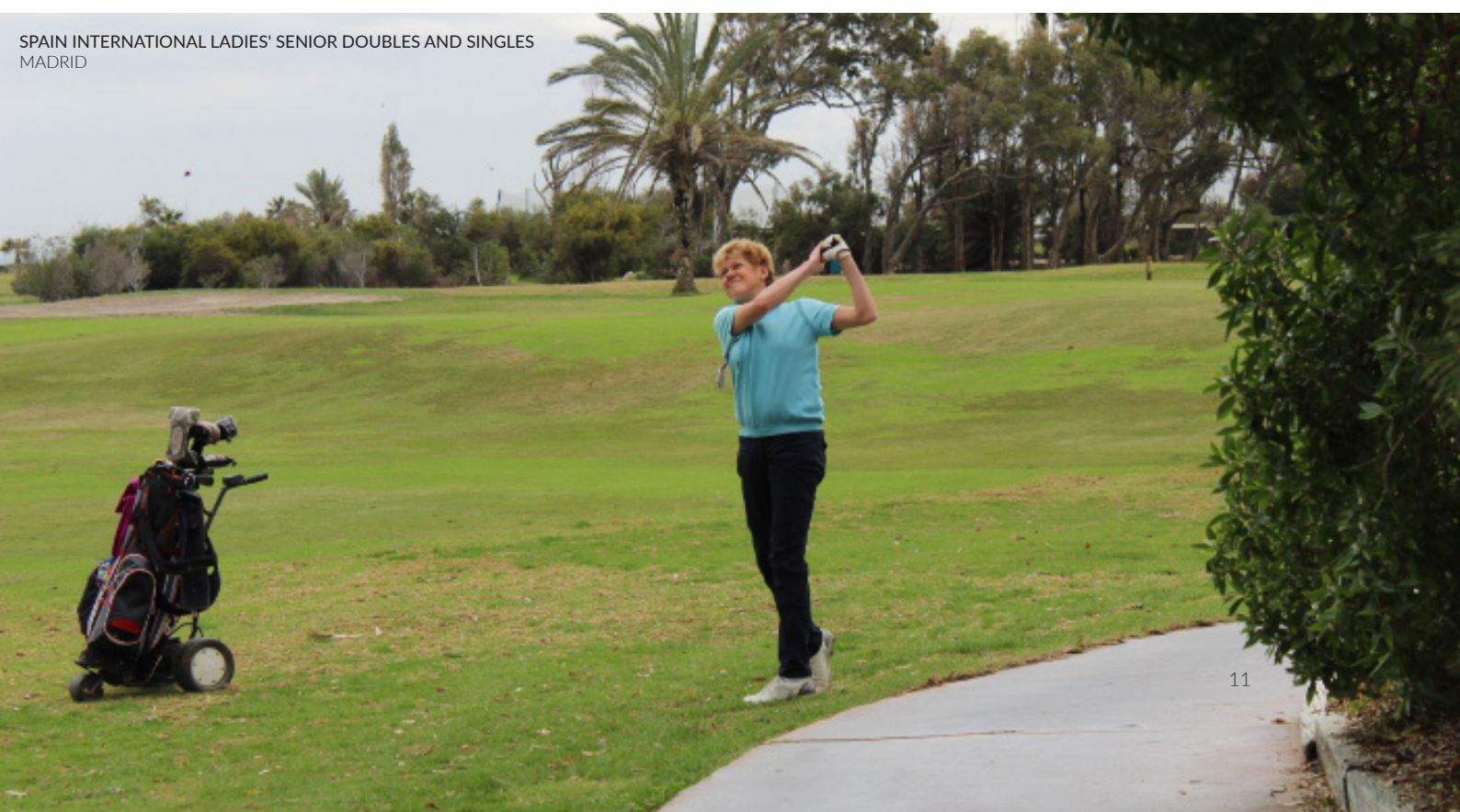
SPAIN INTERNATIONAL LADIES' SENIOR DOUBLES AND SINGLES MADRID

📍 Where: venue changes each year When: March