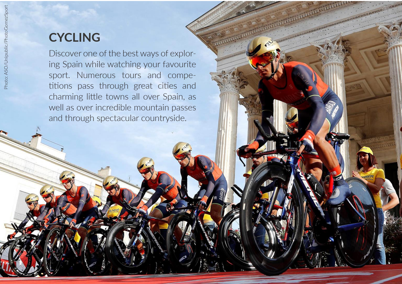
▲ VUELTA CICLISTA CYCLE RACE AROUND SPAIN

Discover one of the best ways of exploring Spain while watching your favourite sport. Numerous tours and competitions pass through great cities and charming little towns all over Spain, as well as over incredible mountain passes and through spectacular countryside.