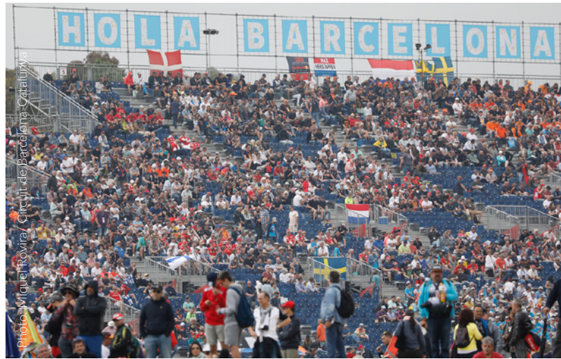
▲ SPANISH FORMULA 1 GRAND PRIX MONTMELÓ