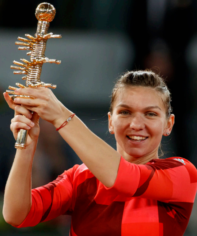
▲ MUTUA MADRID TENNIS OPEN

You can watch games from a unique perspective, as if you were the Hawk-Eye, in the Tennis Garden, a walkway over the courts where you can see the players in action like you've never done before.