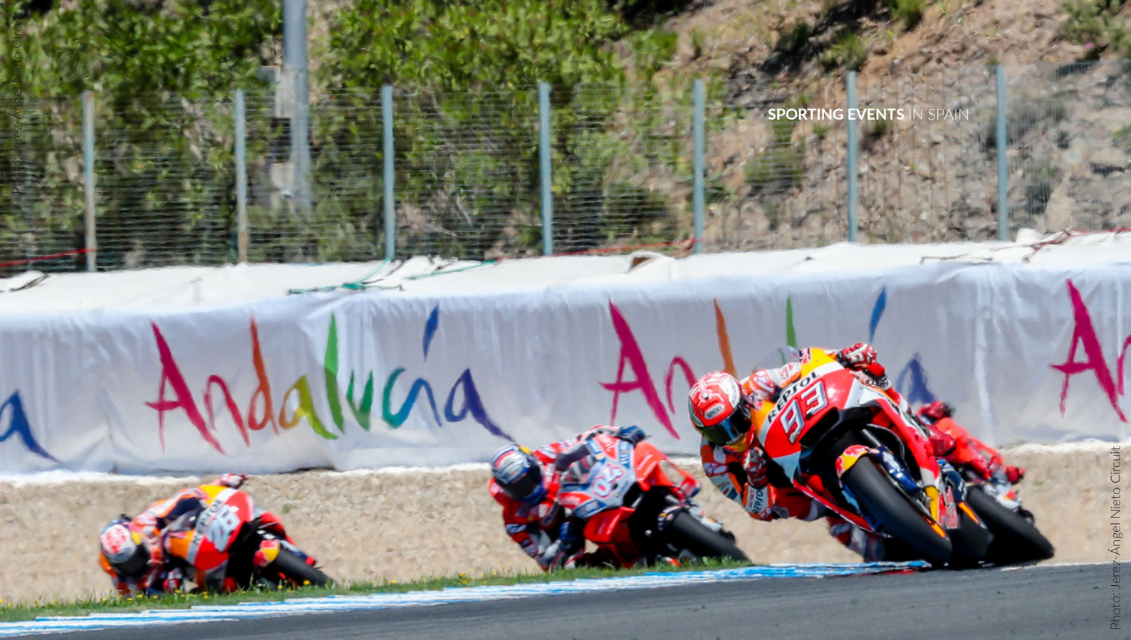
▲ SPANISH MOTOGP GRAND PRIX JEREZ