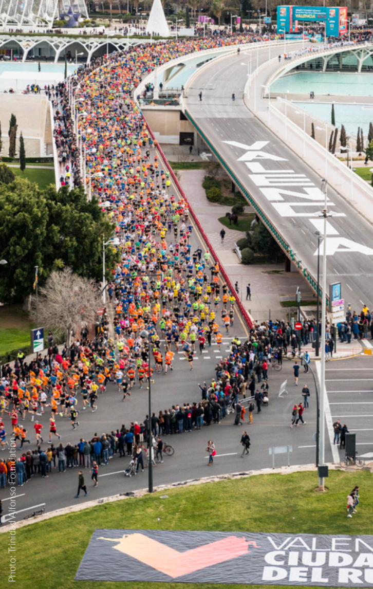
▲ IAAF 2018 WORLD HALF MARATHON CHAMPIONSHIP VALENCIA