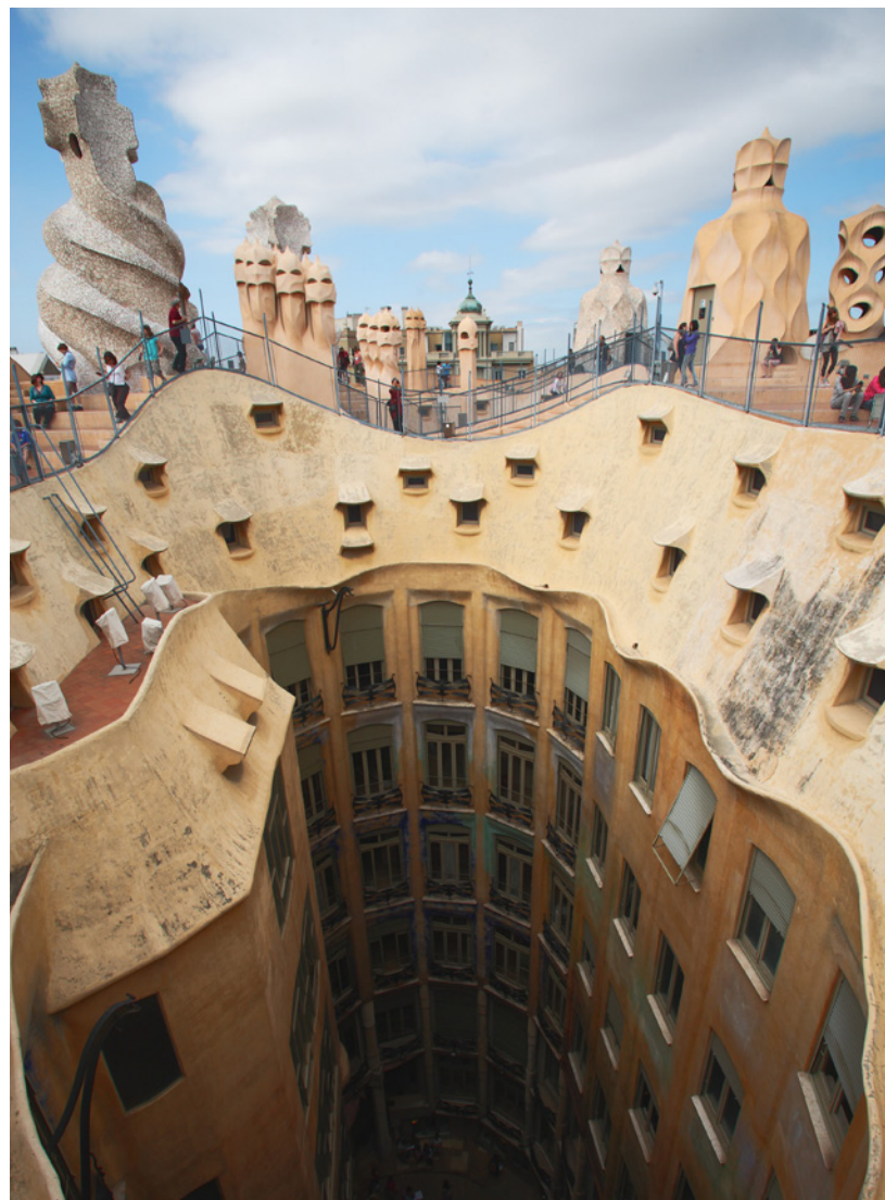
▼ LA PEDRERA-CASA MILÀ BARCELONA

Other sites that you can discover following the steps of the characters in this film are the Tibidabo amusement park, with unsurpassed views of the city, the hustle and bustle and traditional flower stalls of Las Ramblas thoroughfare or the charming Plaza de San Felipe Neri square. In addition to Barcelona, Woody Allen's film also has scenes in Oviedo and Avilés (Asturias), two cities of which the New York genius declares himself to be an admirer.