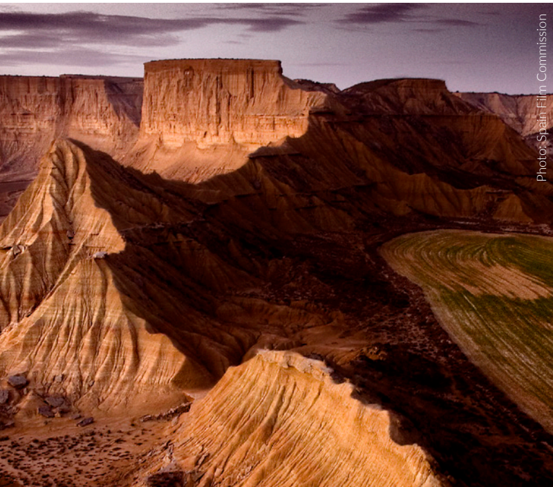
▲ BARDENAS REALES NAVARRE

Next we travel to Girona , where we can discover such places as San Pedro de Galligans Monastery , now the Archaeological Museum of Catalonia. Its interior was used to recreate the library where Sam Tarly attempted to become a maester and made great discoveries about the complex genealogical tree of the Westeros families.