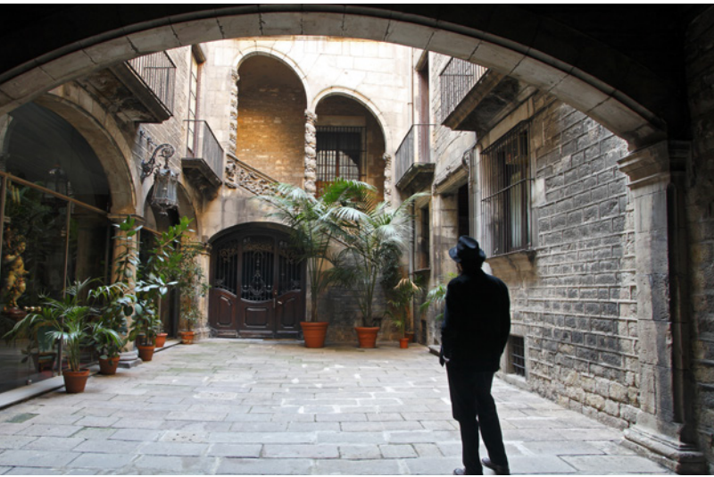
▲ GOTHIC QUARTER BARCELONA

Perfume: The Story of a Murderer , based on the bestseller by Patrick Süskind and directed by Tom Tykwer, is another perfect feature film for discovering the charms of Barcelona, here converted into 18th century Paris. The narrow streets of the Gothic Quarter are the setting for the wanderings of Grenouille, the film's protagonist. There you can see the city's Roman past, ruins of ancient walls, the narrow streets of the Jewish quarter, the Gothic cathedral and the most important of its palaces.