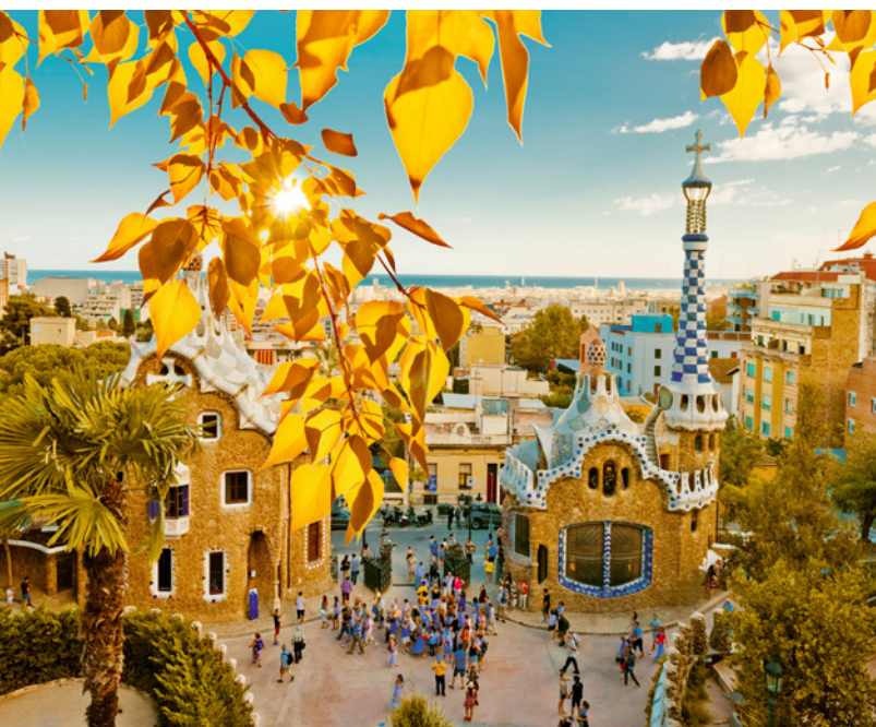
▲ GÜELL PARK BARCELONA