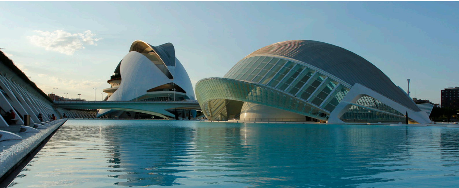
▲ CITY OF ARTS AND SCIENCES VALENCIA