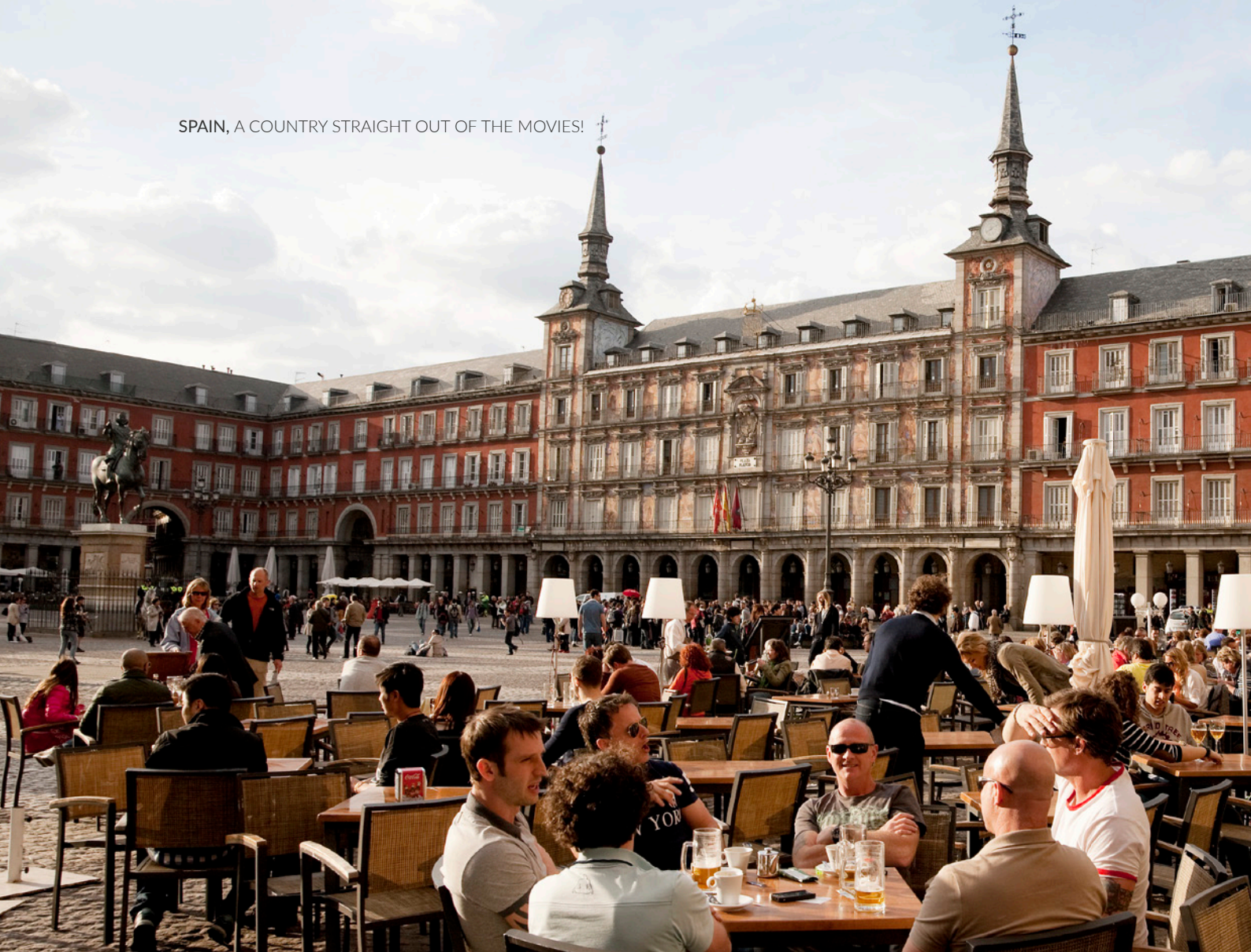
▲ PLAZA MAYOR MADRID

SPAIN, A COUNTRY STRAIGHT OUT OF THE MOVIES!