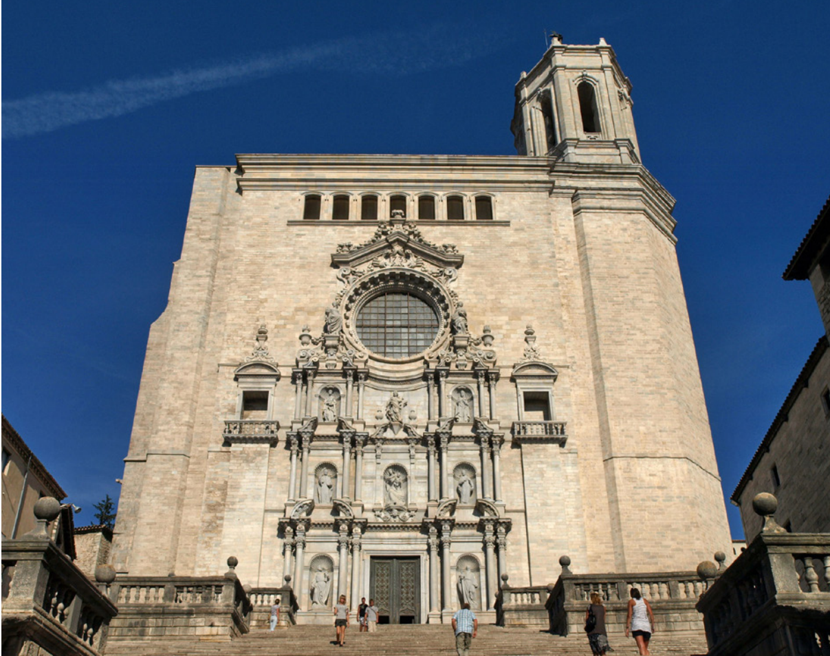
CATHEDRAL OF SANTA MARÍA IN GIRONA

The cobbled streets of the historic district of Girona played host to Arya lost in Braavos and the spectacular steps of its cathedral were used to recreate the Great Sept of Baelor in King's Landing. You will not be able to climb them on horseback, as Jaime Lannister did, but you will be amazed by their imposing size.