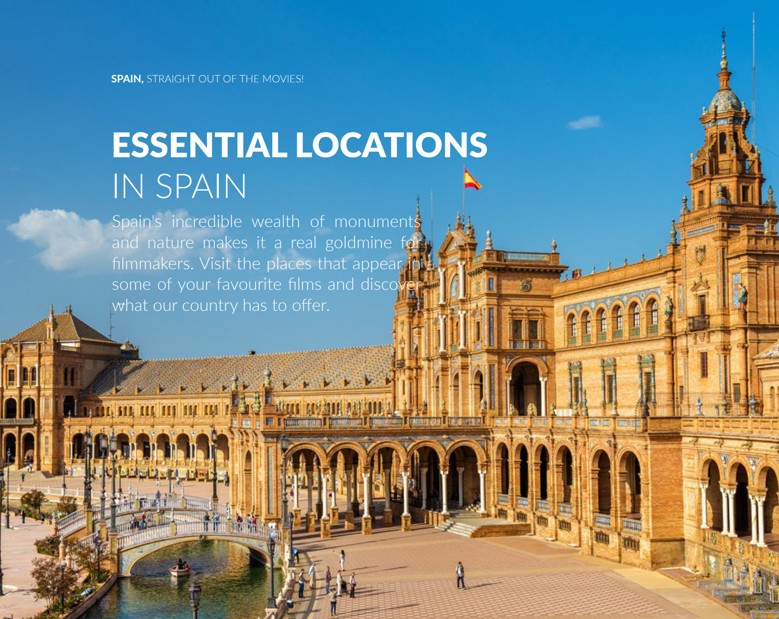
▲ PLAZA DE ESPAÑA SEVILLE

Spain's incredible wealth of monuments and nature makes it a real goldmine for filmmakers. Visit the places that appear in some of your favourite films and discover what our country has to offer.