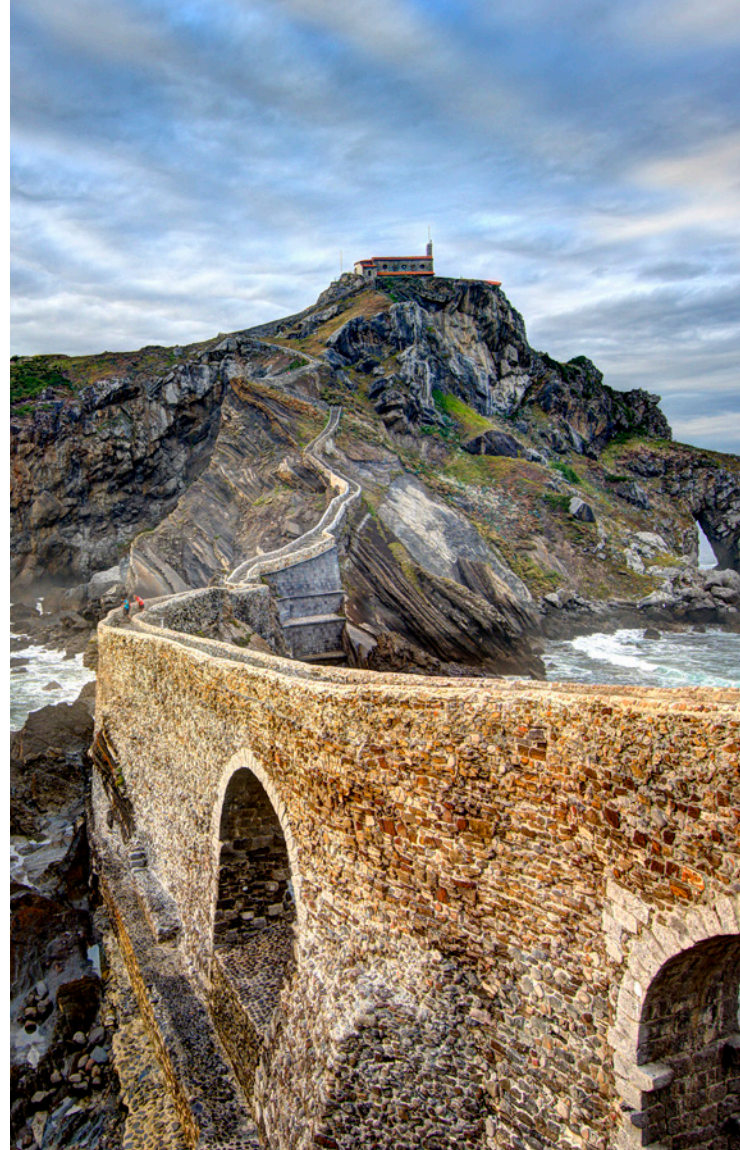
▲ SAN JUAN GAZTELUGATXE SHRINE BIZKAIA

In addition to setting Westeros here, the series' producers have made use of the great variety of landscapes and natural