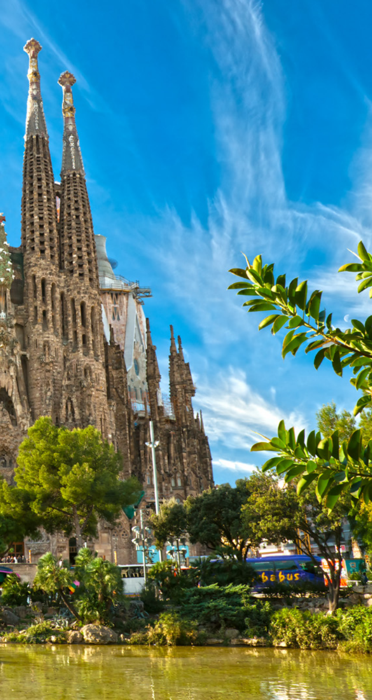
▲ THE BASILICA OF LA SAGRADA FAMILIA BARCELONA

the lizard-shaped fountain. The park's curious shapes and bold colour combinations, mixed with its vegetation, will transport you to a magical world.