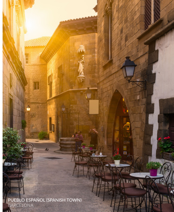
PUEBLO ESPAÑOL (SPANISH TOWN) BARCELONA

Some of the corners of the city shown in Perfume: The Story of a Murderer are not so well known. We are talking about Laberint d'Horta Park , in the north of the city, with its intricate maze of cypresses, temples, fountains and mythological sculptures. And Pueblo Español , an open-air architectural museum located at the foot of Montjuïc hill, with scaled reproductions of buildings, squares and streets representative of various Spanish cities. Its main square is the scene of the film's culminating moment.