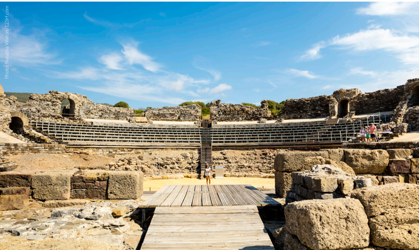
▲ ITÁLICA ARCHAEOLOGICAL SITE SANTIPONCE, SEVILLE PROVINCE

Seville and its Moorish architecture have given life to the southern kingdom of Dorne, the home of House Martell. In the heart of this beautiful city stands the Real Alcázar , one of the oldest palaces in the world and a UNESCO World Heritage Site. This architectural complex was used to recreate the Water Gardens, the private residence of the Lord of Sunspear. Stroll among fountains, orange trees and palm trees that provide a real spectacle for the senses. See for yourself the ruins of Dragonpit, the place where the faces of the saga's two most powerful queens, Cersei