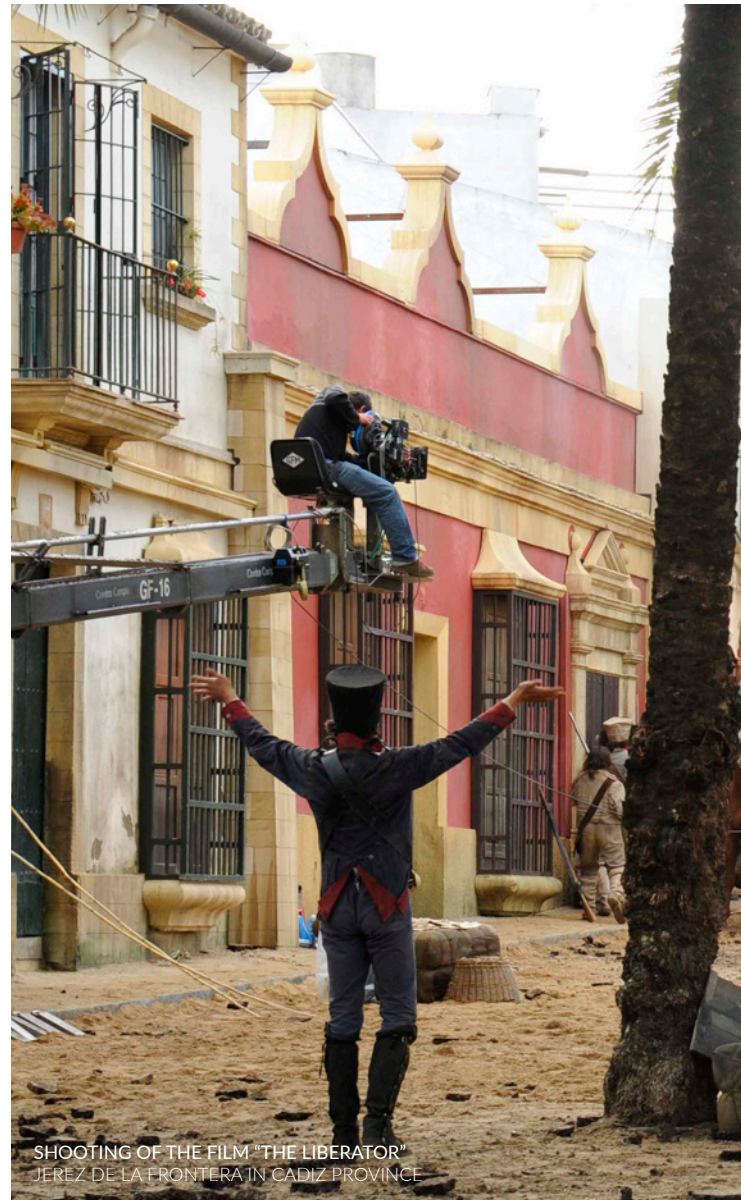
SHOOTING OF THE FILM "THE LIBERATOR" JEREZ DE LA FRONTERA IN CADIZ PROVINCE

The actors appear in the film walking along Calle Ancha , a street that is the city's heart. Stately palaces like Casa de los Cinco Gremios , churches like La Conversión de San Pablo and its buildings' balconies are its main hallmarks.