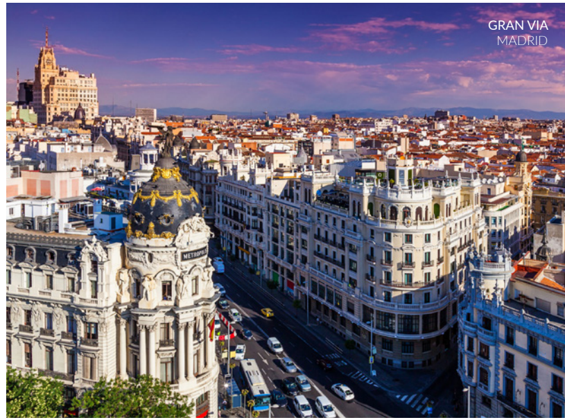
GRAN VIA MADRID

and various aerial shots of Paseo de la Castellana , the city's business centre, the most surprising of the Madrid locations shown in this film starring Matt Damon is Atocha Station and the curious tropical garden inside.