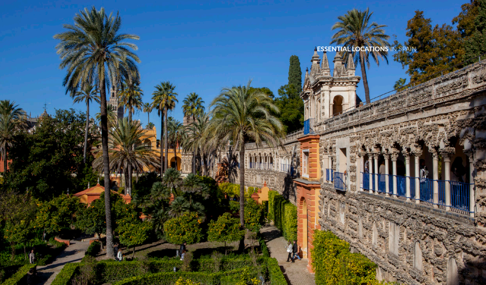
▲ THE MERCURY POOL GARDEN REAL ALCÁZAR PALACE, SEVILLE

Casa de Pilatos is another of the places that captivated Scott, who chose this palace in Italian-Mudéjar Renaissance style as the location for the residence of the Roman praetor in Jerusalem. Take a look inside and go into the very beautiful interior gardens, typical of noble palaces in the city centre, with beautiful plaster skirting and Plateresque style grilles.