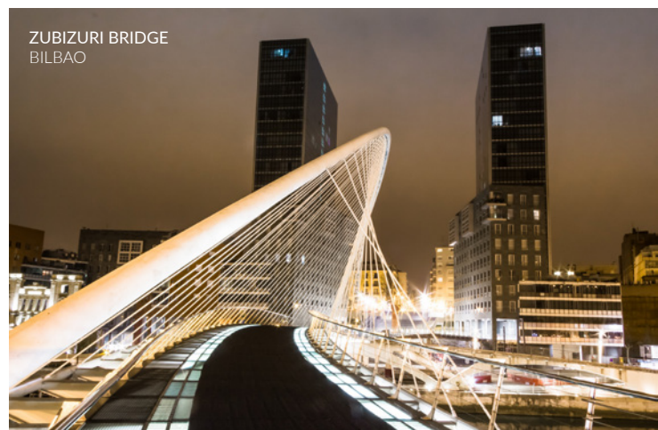
ZUBIZURI BRIDGE BILBAO

The other building featured in one of the scenes is the Zubizuri Bridge , designed by Santiago Calatrava, bringing to the film that futuristic touch so much appreciated by lovers of science fiction.