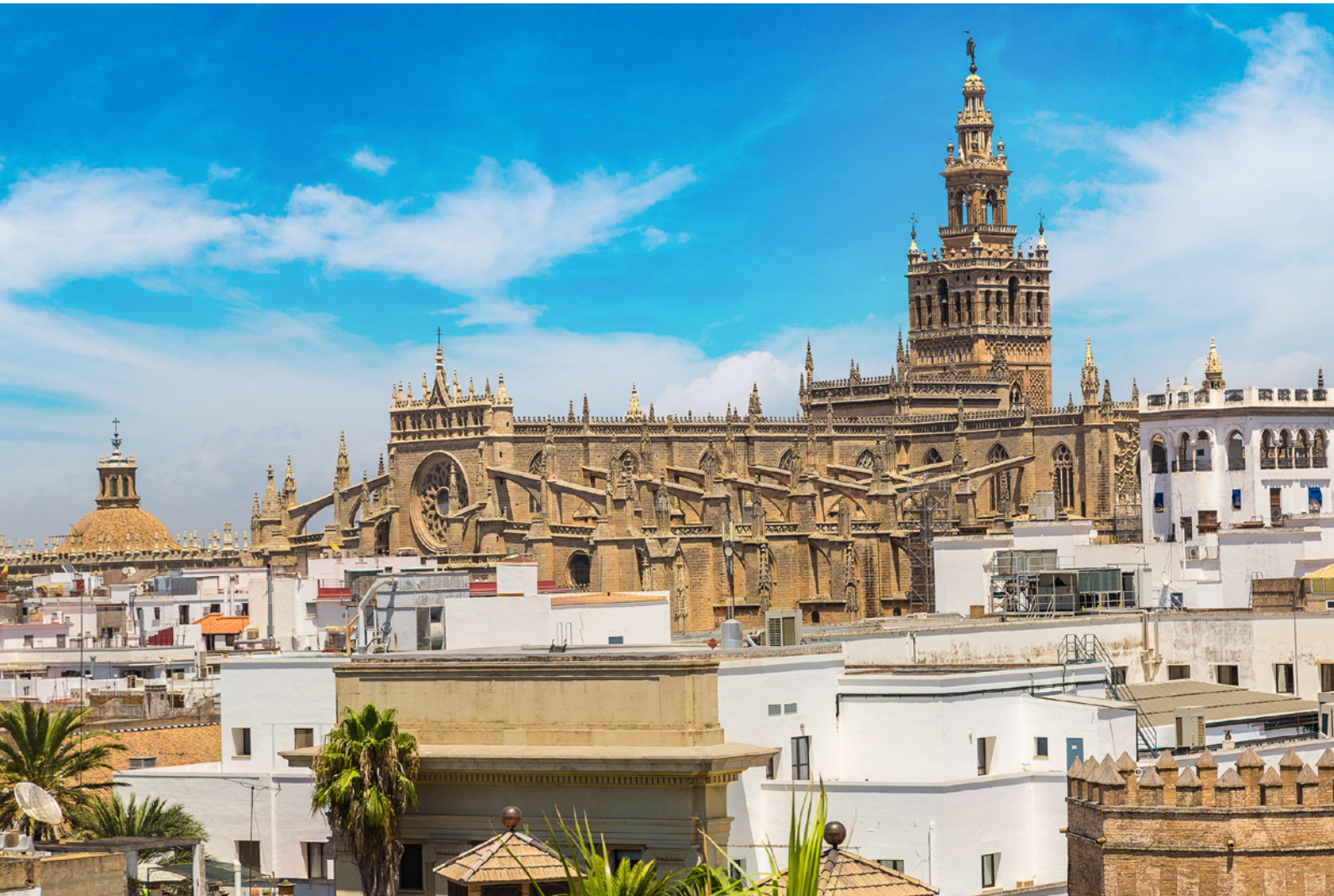
▼ CATHEDRAL OF SANTA MARÍA DE LA SEDE SEVILLE

If your visit coincides with Easter Week or the April Fair you'll be able to take part in one the most impressive popular festivals in the country.