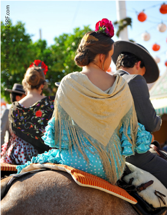
▲ APRIL FAIR SEVILLE