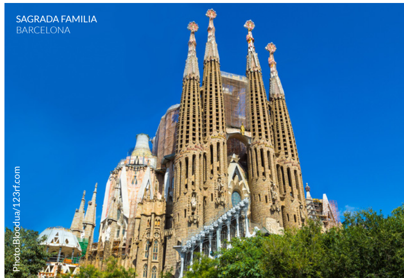
SAGRADA FAMILIA BARCELONA