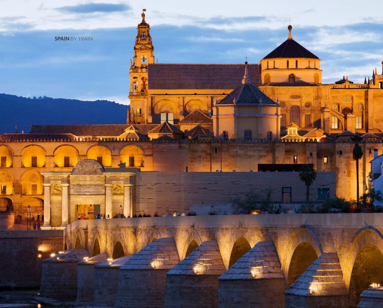
▲ MOSQUE-CATHEDRAL CORDOBA