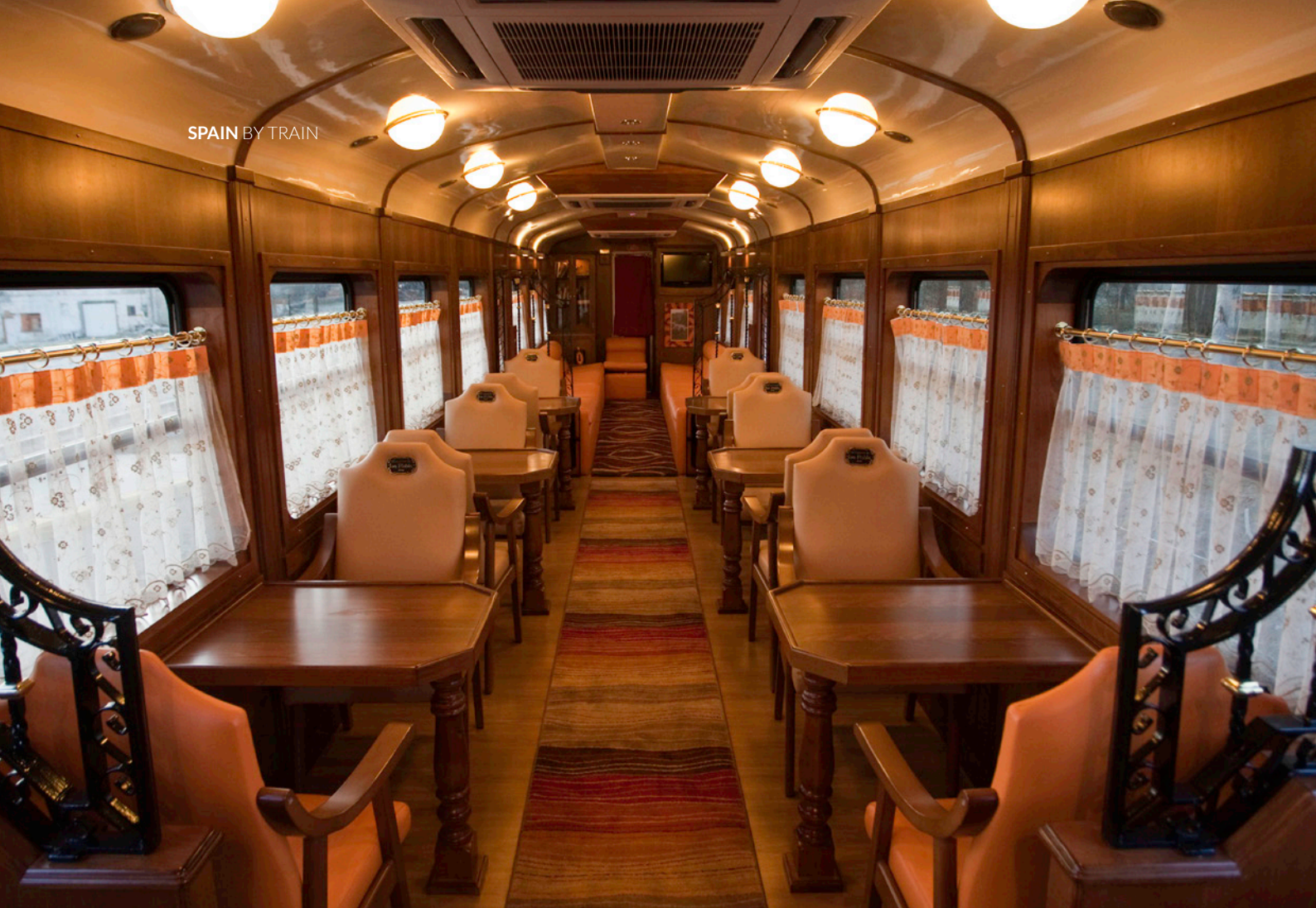
▲ LA ROBLA EXPRESS