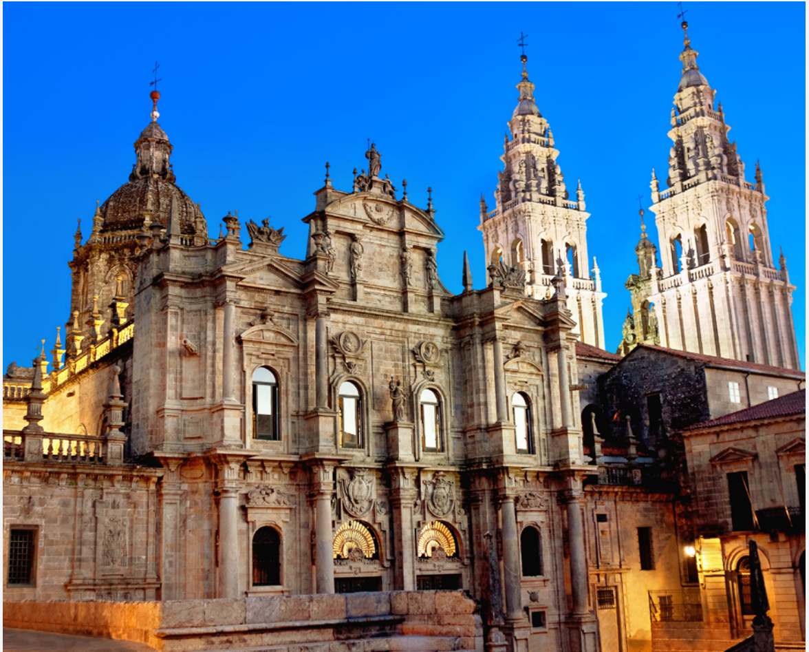
▲ SANTIAGO CATHEDRAL SANTIAGO DE COMPOSTELA