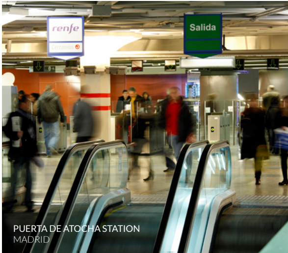
PUERTA DE ATOCHA STATION MADRID

There are more suggestions for organised train journeys. Here are just a few of them.