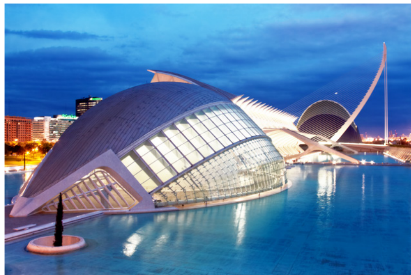
▲ CITY OF ARTS AND SCIENCES VALENCIA

① For more information on HST routes and timetables, click here: www.renfe.com/viajeros/larga_distancia/productos/