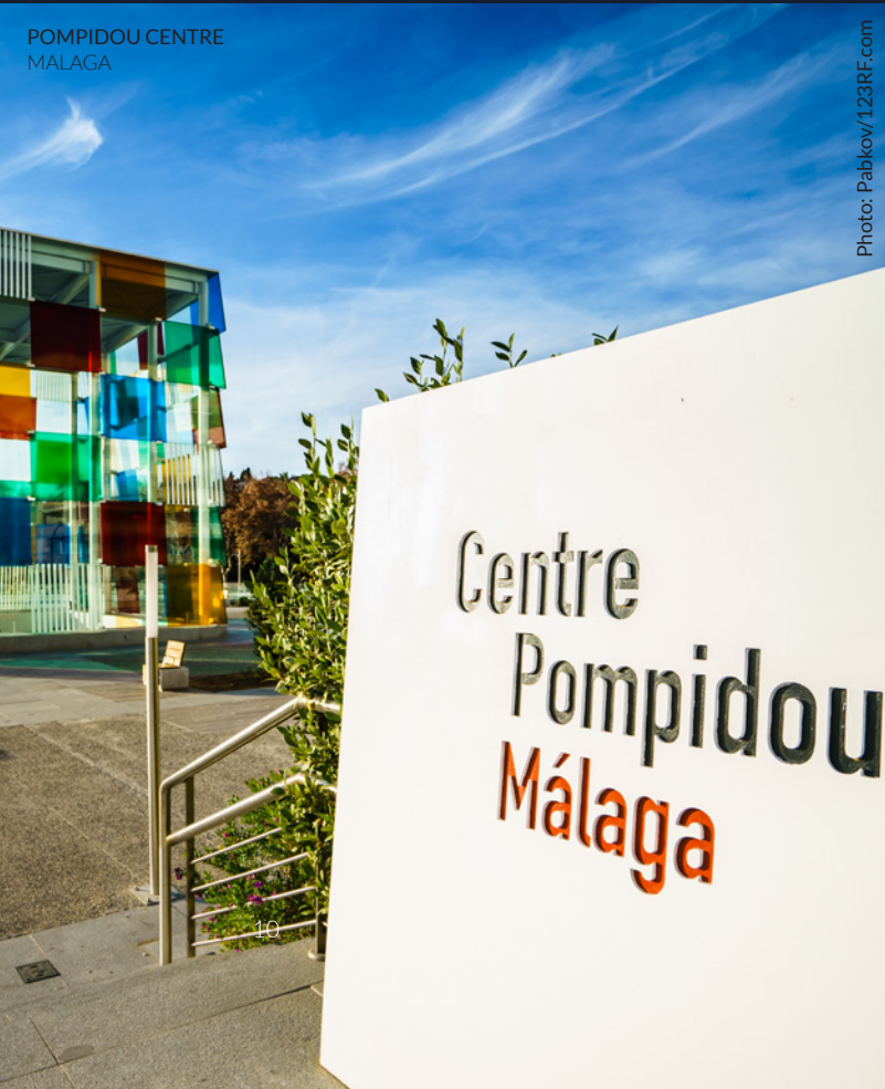
POMPIDOU CENTRE MALAGA

It's only two hours twenty minutes from Madrid to the Mediterranean city where the amazing artist Pablo Picasso was born.