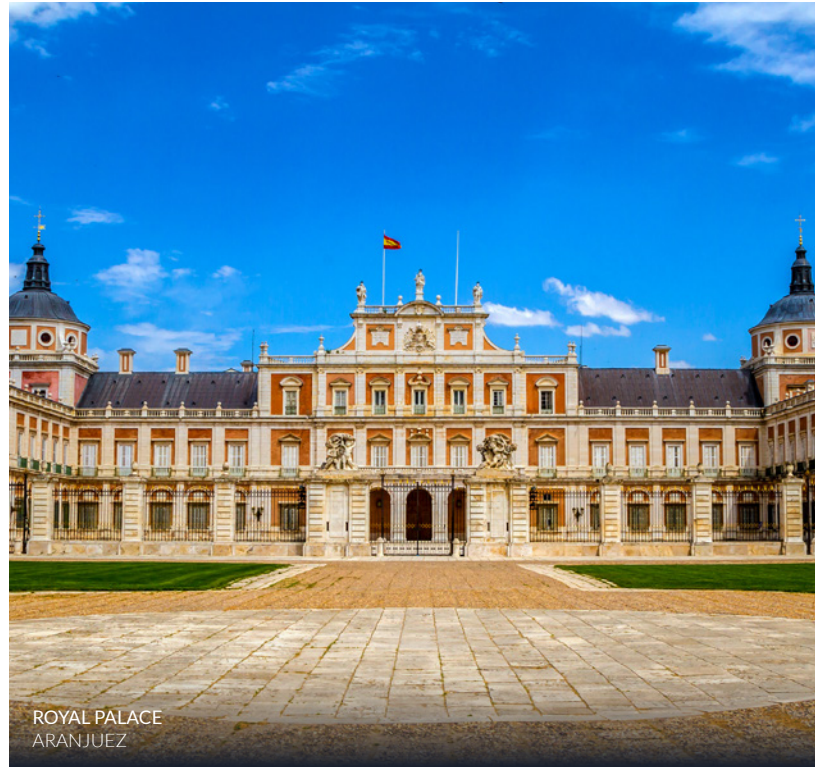
ROYAL PALACE ARANJUEZ

While you're in Madrid, take the Medieval Train and combine history, theatre and gastronomy in a single day. It takes no time at all to reach Sigüenza in Guadalajara, you'll spend about an hour and a half immersed in a Medieval atmosphere surrounded by actors playing the roles of typical characters from the era: troubadours, stilt walkers, jugglers. You'll even be served typical sweets while you're on board. When you reach your destination you'll be shown around the town by local guides. You'll be fascinated by the majestic cathedral, the castle and the main square. There'll be typical dishes like traditional breadcrumbs and Castilian soup and for dessert you should try some Doncel egg yolks.