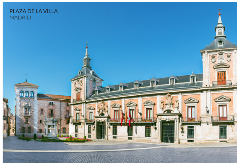
PLAZA DE LA VILLA MADRID

You'll just love this cosmopolitan, avant-garde, Mediterranean city which is full of surprises. Moving around on foot or bicycle you can discover neighbourhoods such Las Ramblas and the seafront promenade. Deep in the renowned Gothic Quarter you'll feel like you're back in the Middle Ages. Take a leap forward to Catalan Modernism with Antonio Gaudí: you'll be impressed by his masterpiece, the Sagrada Familia , and the Park Güell . Check out the city's incredible cultural agenda and sign up for exhibitions, concerts, functions... You'll love the cuisine in Barcelona which is a perfect blend of tradition and creativity. Give yourself a treat: try the craft pastries and sparkling wines. You can also take the HST to Barcelona from Malaga.