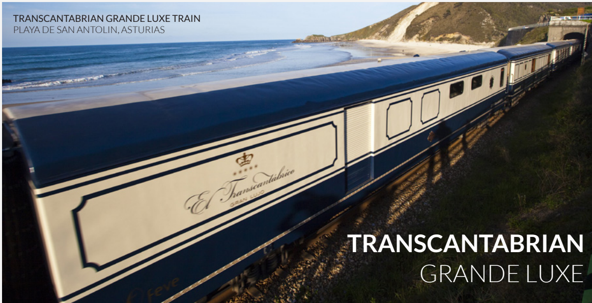
TRANSCANTABRIAN GRANDE LUXE TRAIN PLAYA DE SAN ANTOLIN, ASTURIAS