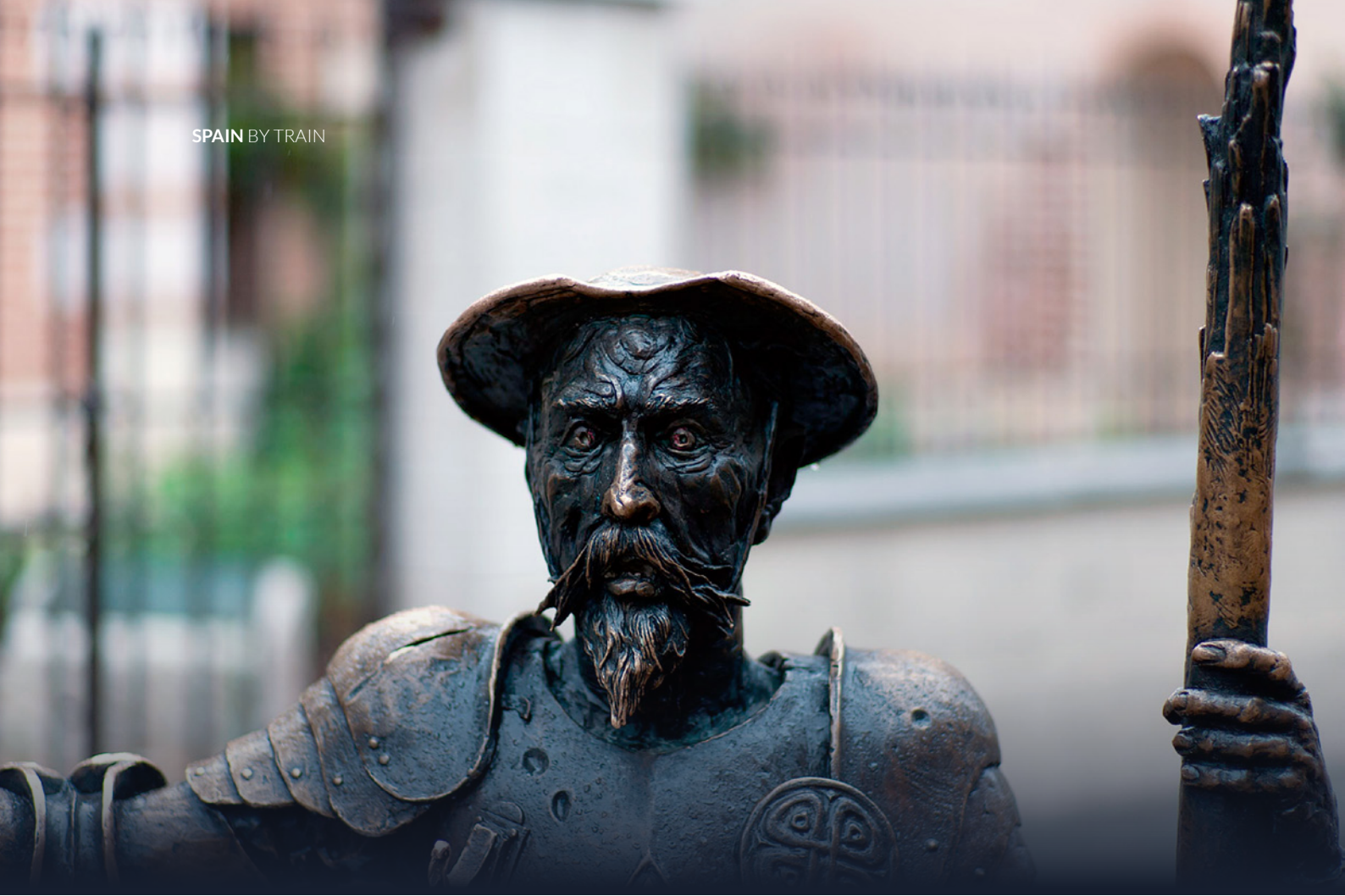
▲ SCULPTURE OF DON QUIXOTE ALCALÁ DE HENARES (MADRID)