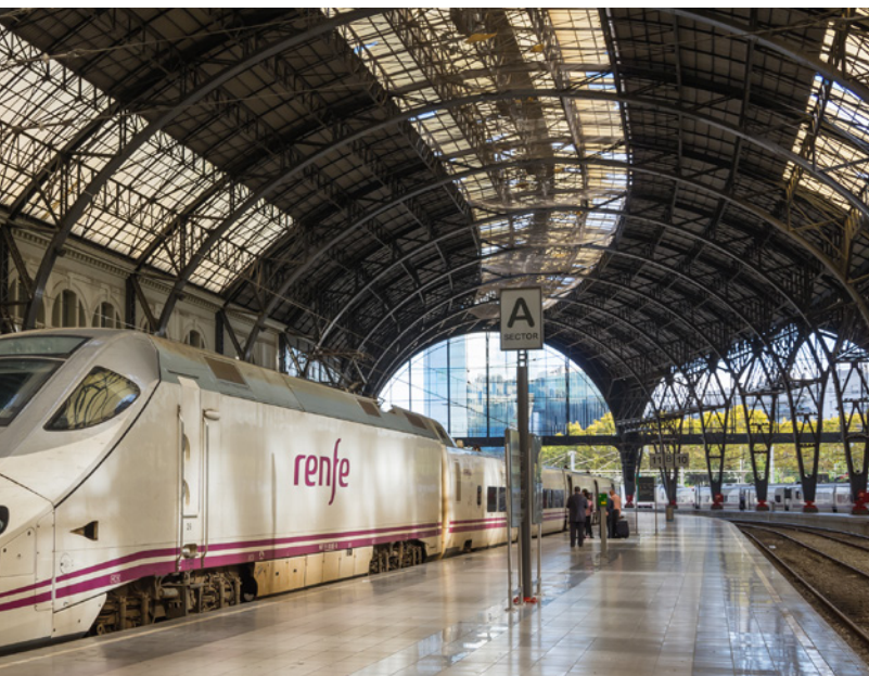
▲ FRANCIA STATION BARCELONA

Ministry of Industry, Trade and Tourism Published by: © Turespaña Created by: Lionbridge NIPO: 086-18-006-3