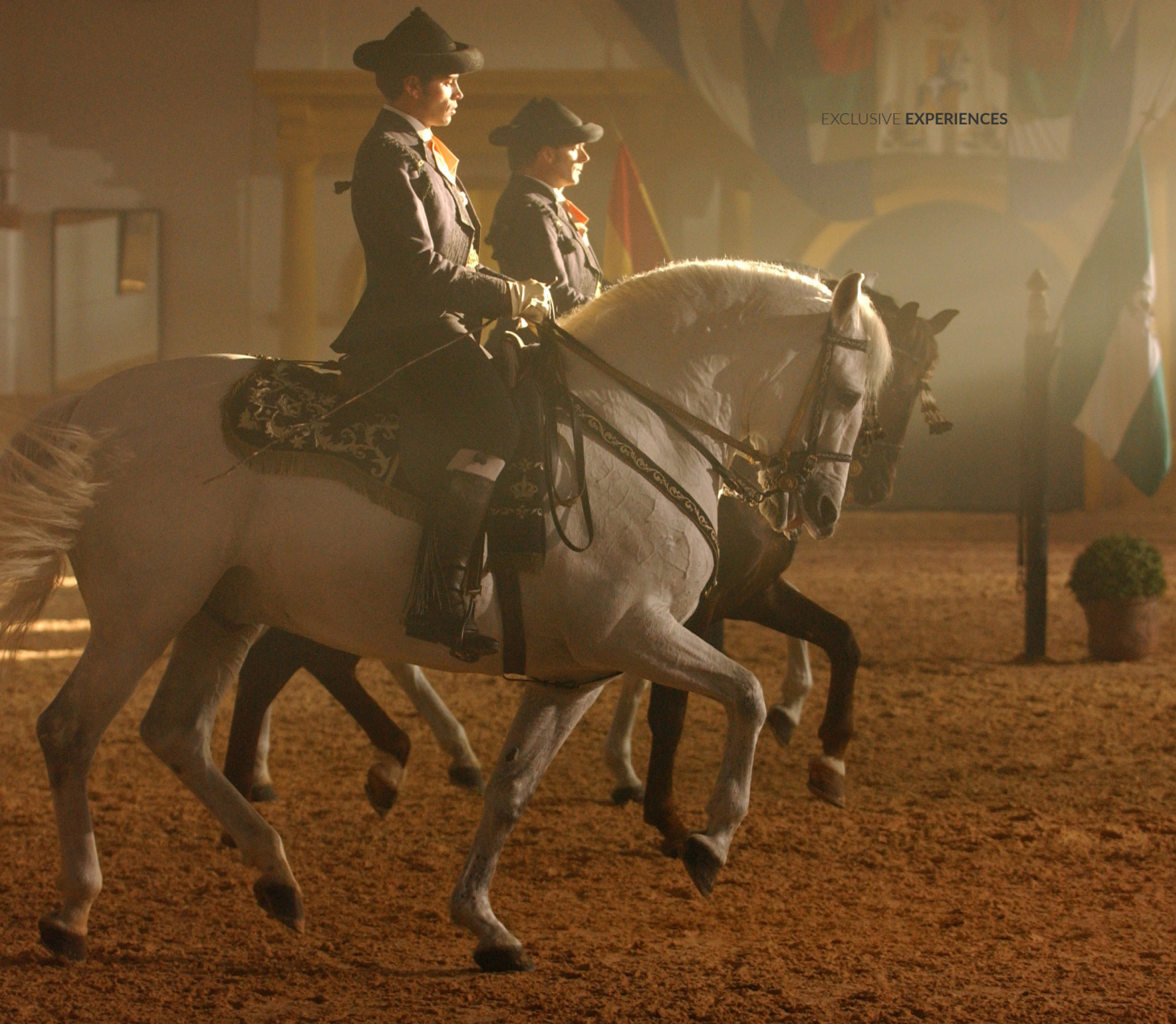
▲ ROYAL ANDALUSIAN SCHOOL OF EQUESTRIAN ART JEREZ DE LA FRONTERA