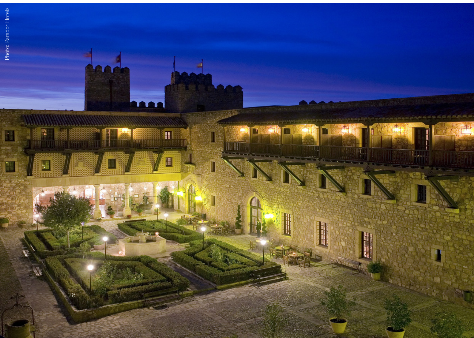
▼ SIGÜENZA PARADOR HOTEL GUADALAJARA

Alternatively you could rent a private villa where you'll enjoy all the advantages of top-level accommodation exclusively for you and your friends or family. You could also be enjoying magnificent sports facilities and services, from private chefs to personalised leisure plans.