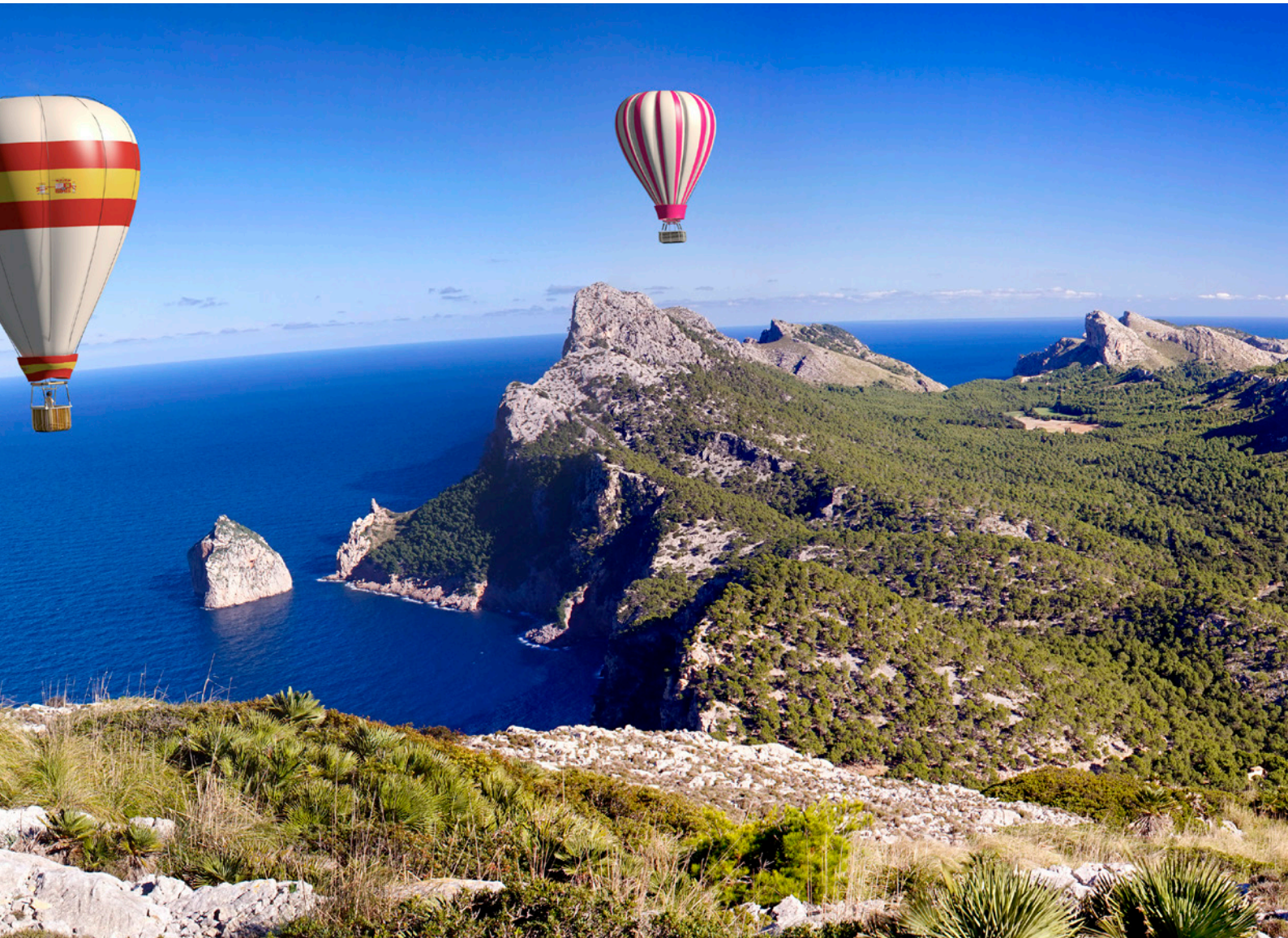
▲ OVER MALLORCA IN A BALLOON