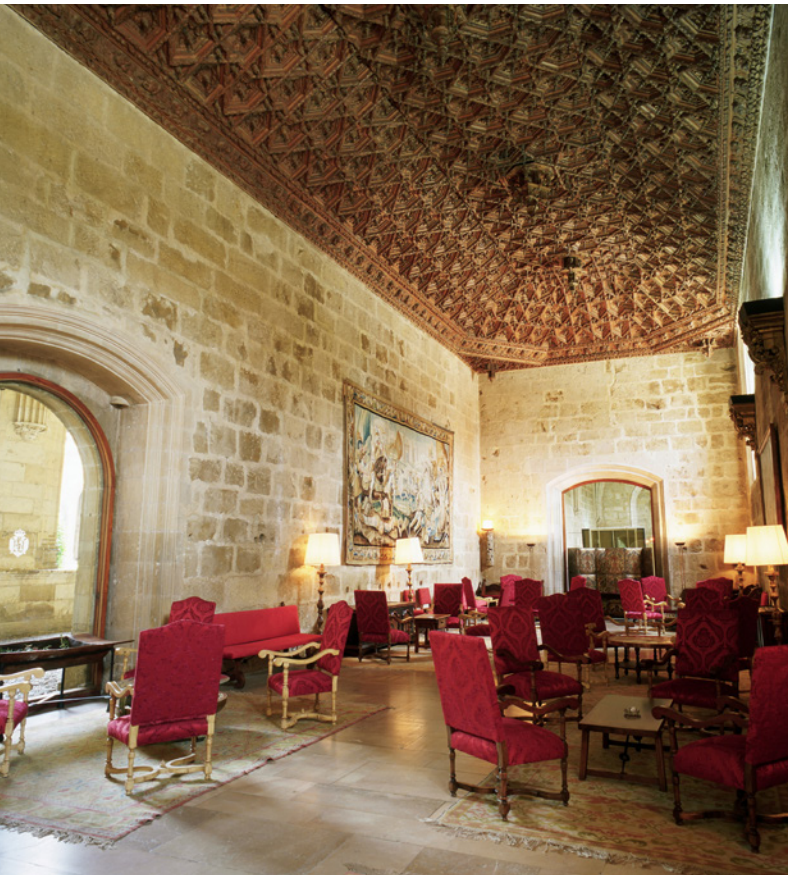
▲ PARADOR HOTEL LEÓN

There is delightful accommodation to be found in all the different regions in Spain. Whichever you choose you're sure to be surprised. The most luxurious ones provide services like private massages, suites with a Hammam open to the countryside, private chefs, their own vegetable gardens... Get a really intense Spanish feeling in an Andalusian Cortijo , a delightful, exquisitely decorated, whitewashed farmstead with maximum comfort and a chance to relax amongst olive groves and the scent of orange blossom. Enjoy being surrounded by the sea and the mountains in an Asturian Mansion or a Country House in Galicia . Or perhaps a Hostelry in Extremadura , in a historical building full of personality.