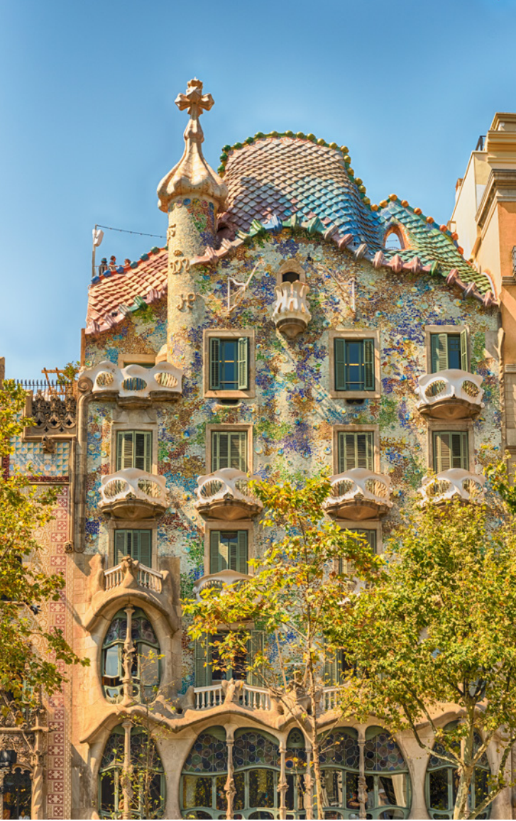
▲ CASA BATLLÓ

Explore the Diagonal , which runs from the Sagrada Família to the Camp Nou in search of the best brands. Whilst you're there you can admire the original architecture of the buildings housing prestigious stores selling fashion, furniture and home decor, as well as shopping centres. On a visit to the stadium of F.C. Barcelona you can buy shirts featuring their players in the enormous official shop.