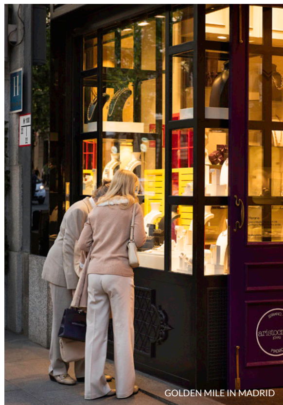
GOLDEN MILE IN MADRID

The attraction of the Salamanca neighbourhood is its exclusive shopping : the Golden Mile , in the area around the Calle Serrano , is a showcase of luxury for fashion, shoes and jewellery in really exclusive stores. You also have the city's most glamorous shopping centres: Jardín de Serrano and ABC Serrano.