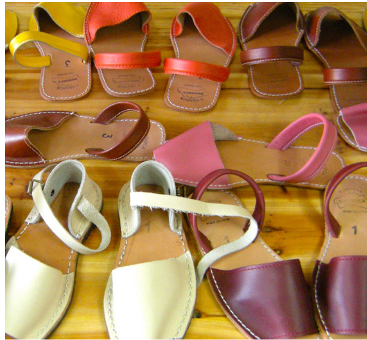
▲ MINORCAN MINORCA

Ubrique , in the Sierra de Cádiz mountains, is paradise for lovers of traditionally hand-made leather goods. There are some 40 workshops, and the streets are full of shops selling top-quality footwear, bags, wallets and purses. There must be a reason why the world's major brands manufacture their products here.