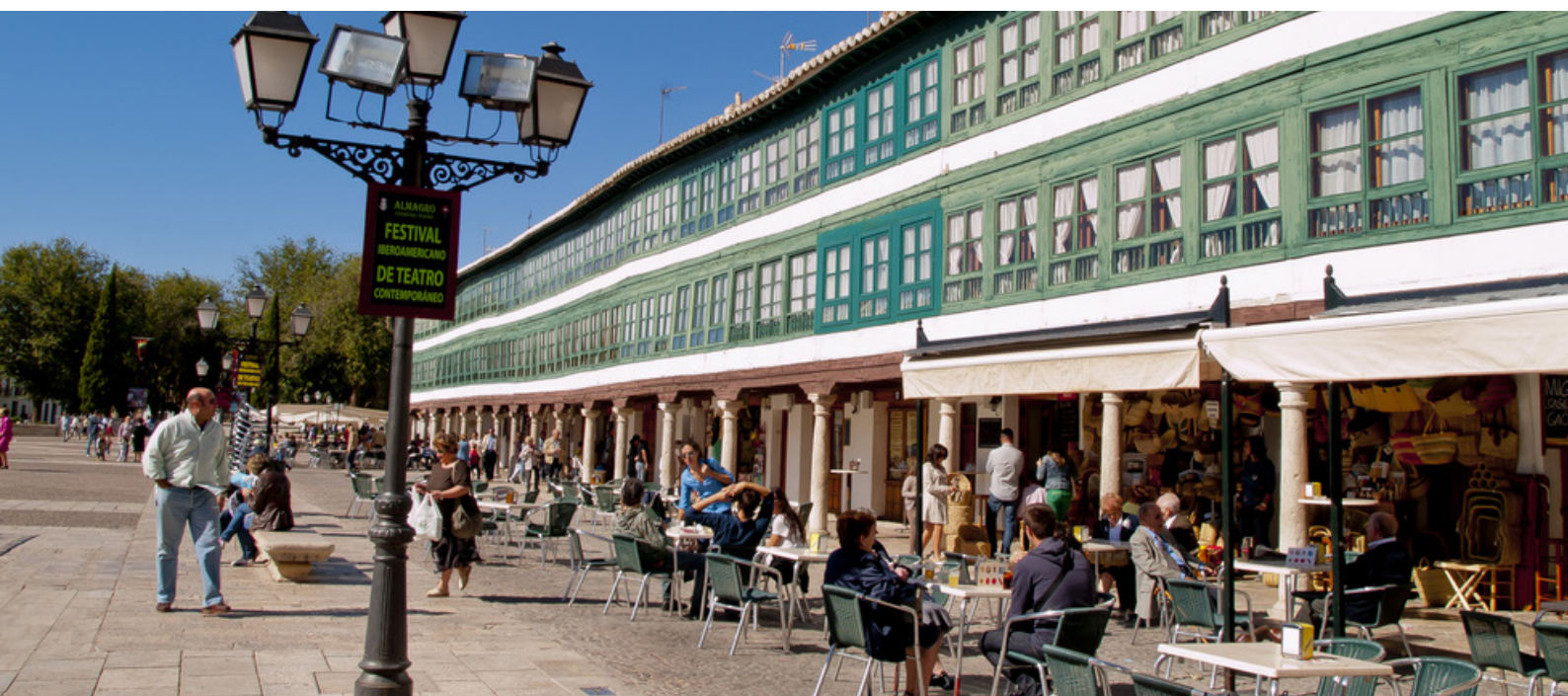
▲ ALMAGRO CIUDAD REAL

In Mallorca there are three factories which still use the glass-blowing technique: you can visit them and see the ovens where they manufacture coloured glasses, lamps, plates and chandeliers. You can purchase unique pieces and even blow your own glass bubble.