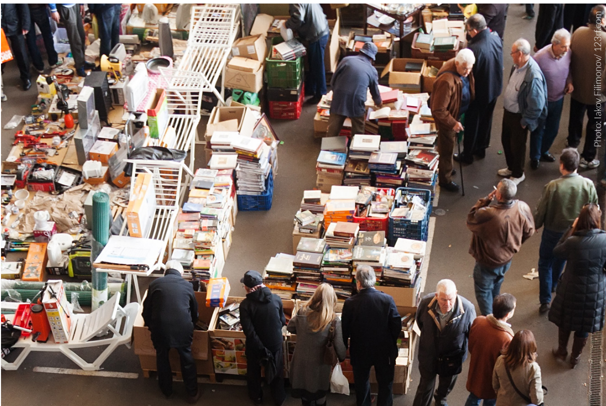
▼ ELS ENCANTS MARKET BARCELONA

If there's something that's hard for you to find, be it new or second-hand, then the Mercat dels Encants may be the place: there's everything imaginable including clothes, handicraft, machinery, domestic appliances, books, CDs, etc. Articles are sold by public auction three times a week, which is what makes it different from other markets in Europe. The stalls stand below an extraordinary mirrored roof which is 24 metres above the ground. There are also a number of food stalls.