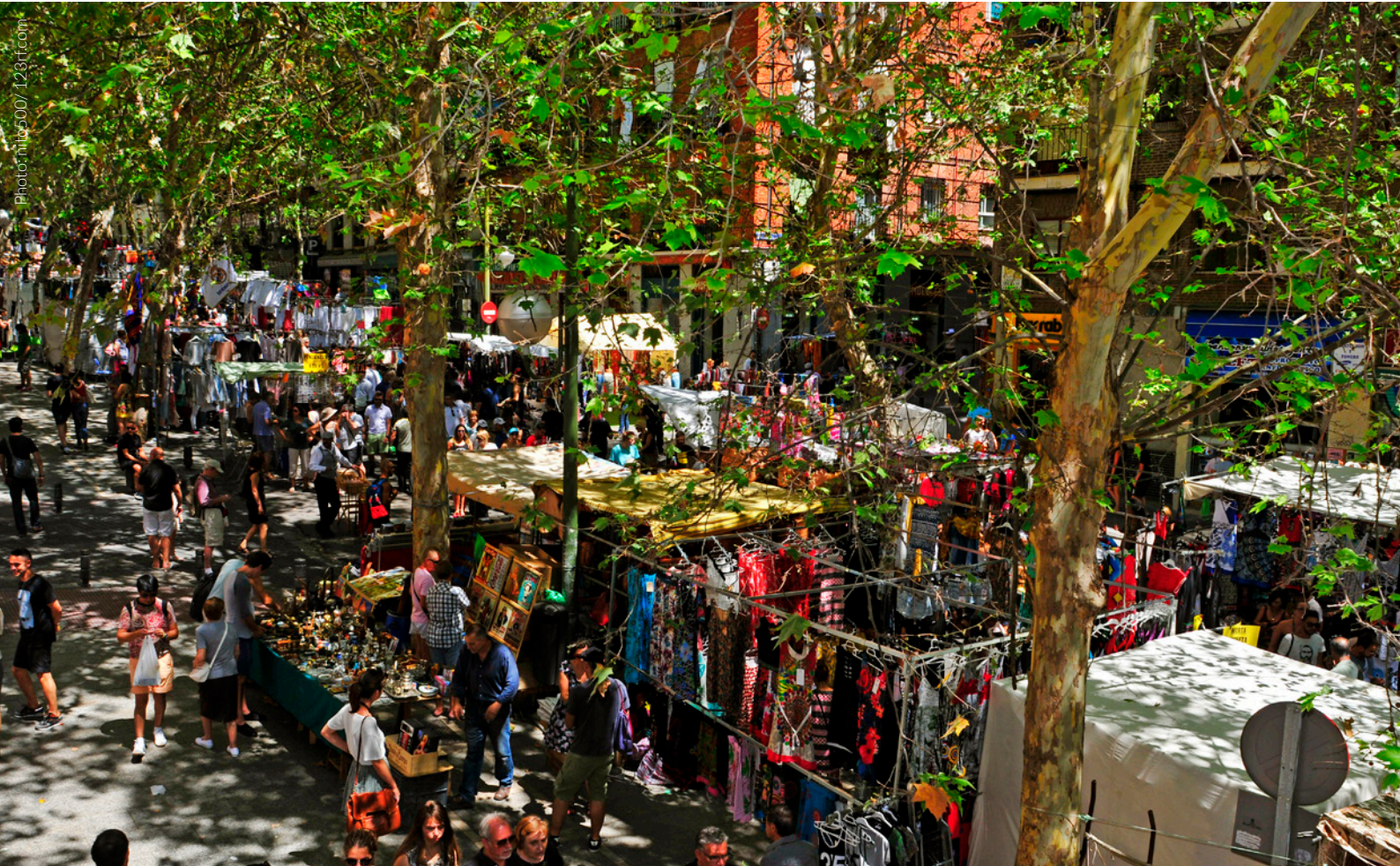
▲ EL RASTRO MADRID

If you are attracted by the glamour of the past and enjoy browsing in second-hand shops, then Spain is the place for you.