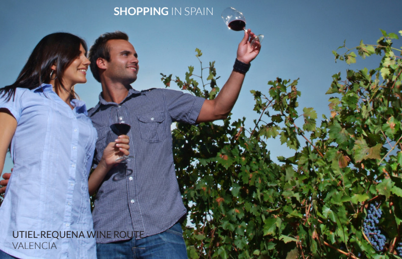
UTIEL-REQUENA WINE ROUTE VALENCIA