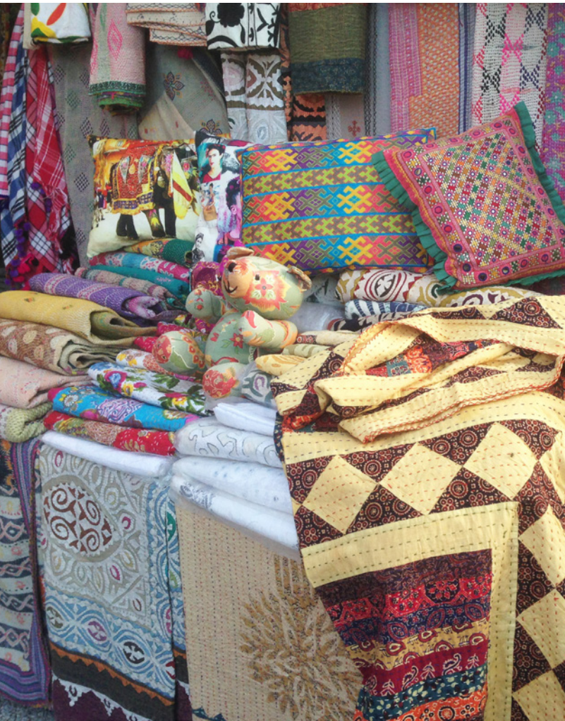
▲ LAS DALIAS IBIZA

In Málaga (Andalusia), on the first Friday of the month, you'll find everything you were looking for at the La Térmica Nocturnal Cultural Flea Market which opens at sunset. Clothing and accessories, illustrations, engravings, signs, antiques, toys, merchandising, music... Ideal for collectors and lovers of everything vintage. And there's entertainment and culture included: concerts, theatre, screenings and gastronomic events. This cultural venue is located in the old Casa de la Misericordia building.