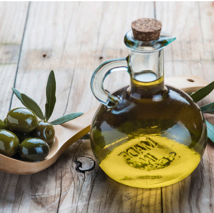
▲ OLIVE OIL