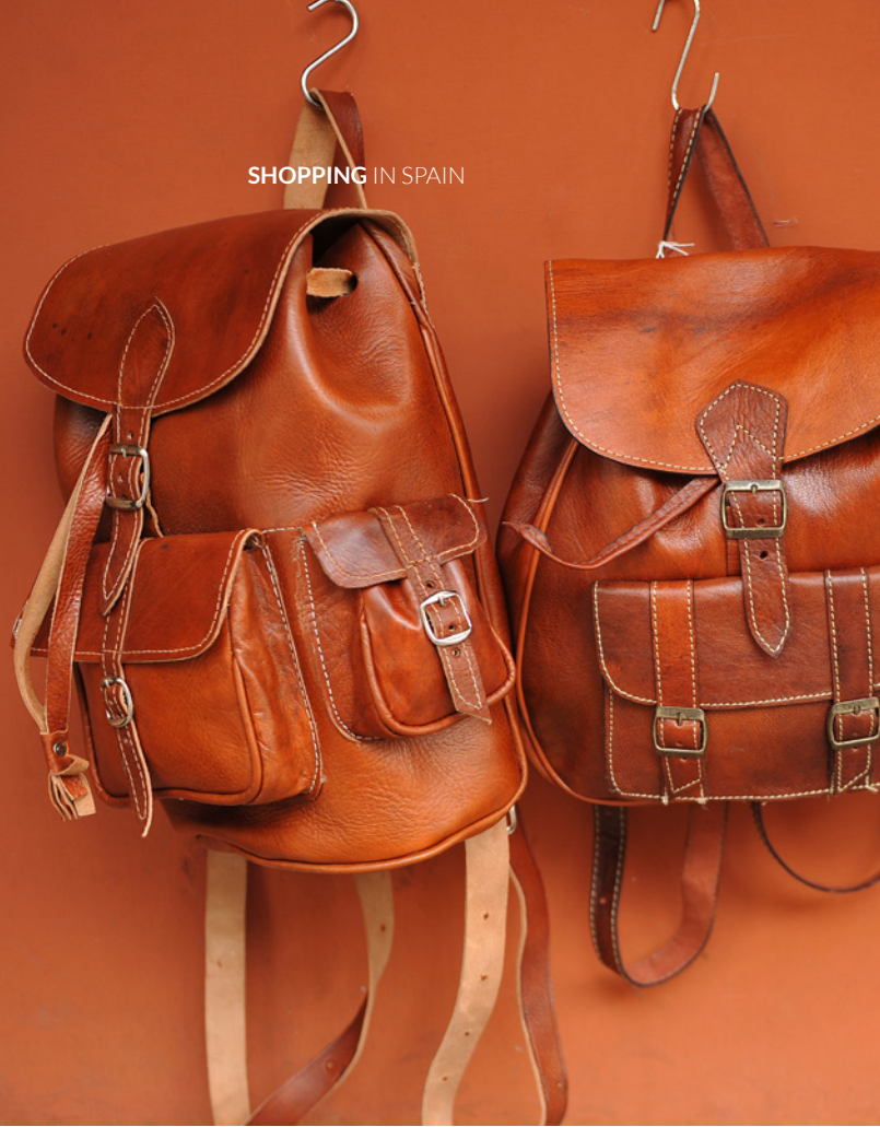
▲ UBRIQUE CÁDIZ

Master weavers have been producing hand-made tapestries, carpets and textile coats of arms since 1720. Their creations can be seen in Spain's most famous palaces. Apart from enjoying the extraordinary collection in the museum, you can learn the secrets of this ancestral craft on a visit to the original workshops.