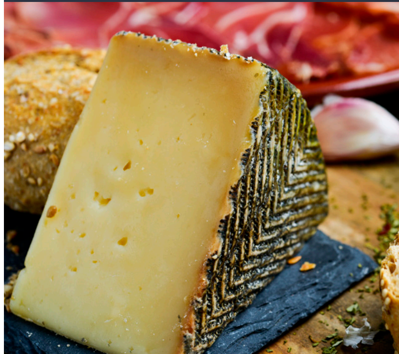
▲ MANCHEGO CHEESE

In Jaén (Andalusia) you can take the Olive Oil Route, amidst vast groves of olive trees all around the Sierra Mágina Nature Reserve. Córdoba (Andalusia) is another of Spain's main oil-producing regions, where numerous towns have strong links with olives. Many of them organise breakfasts and oil-tasting sessions with olive oil playing the lead role.