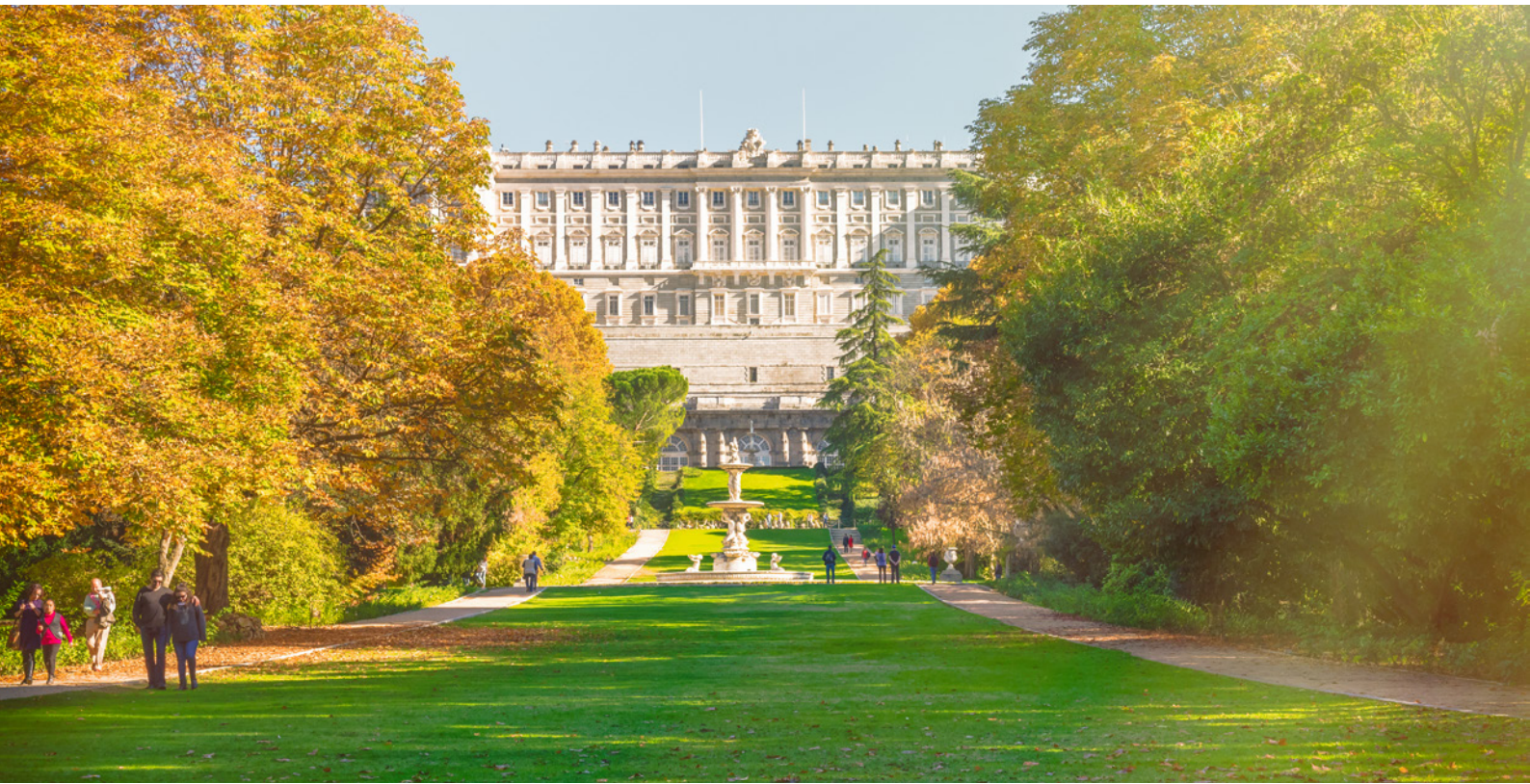
▲ ROYAL PALACE