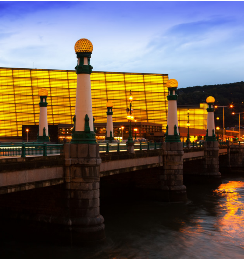
▲ KURSAAL CONFERENCE CENTRE