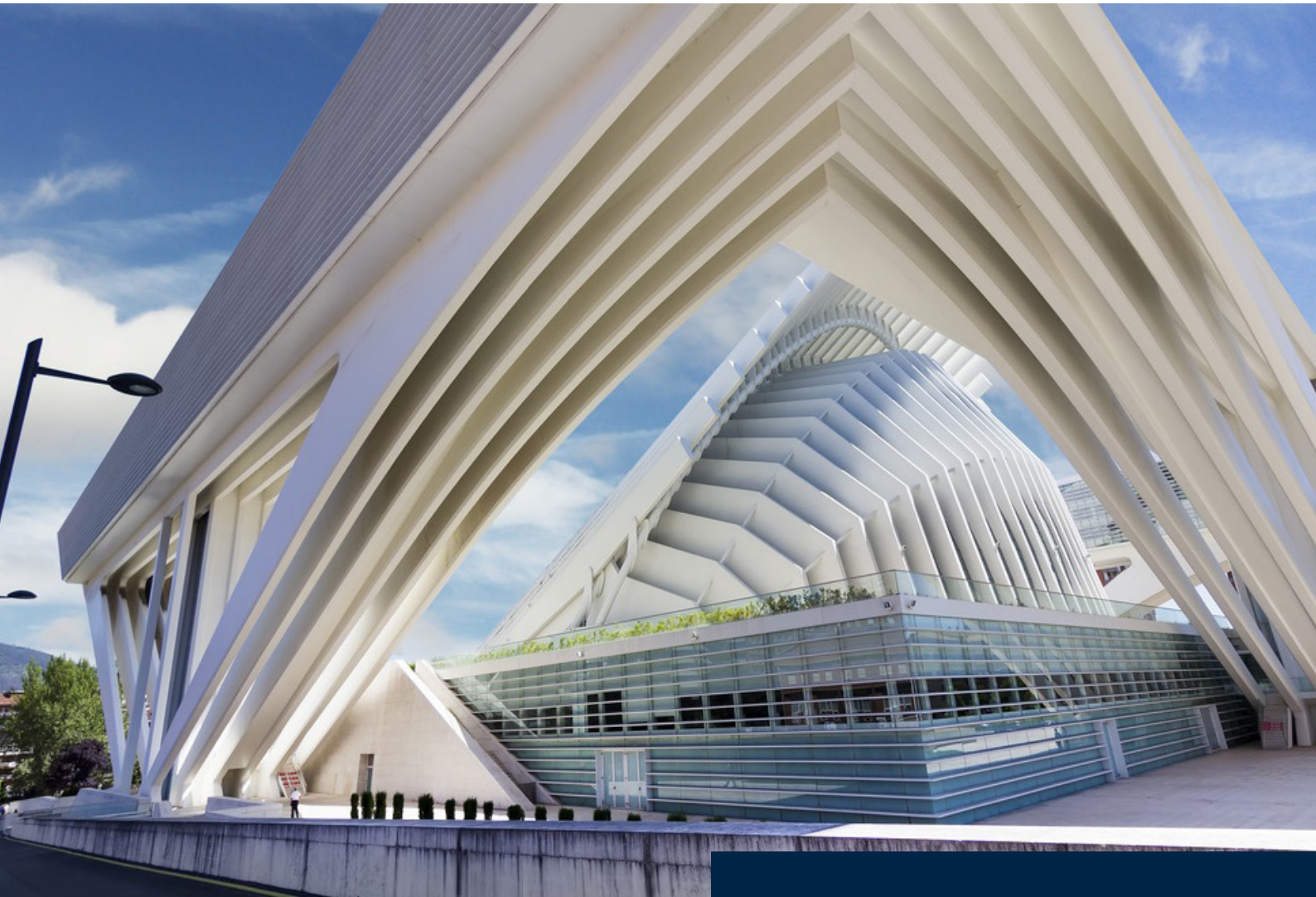
▲ OVIEDO CONFERENCE CENTRE

Then there are the main international associations for the sector, like ICCA , SITE and MPI , all of which have a specific chapter in which the Spanish professional organisations are included.