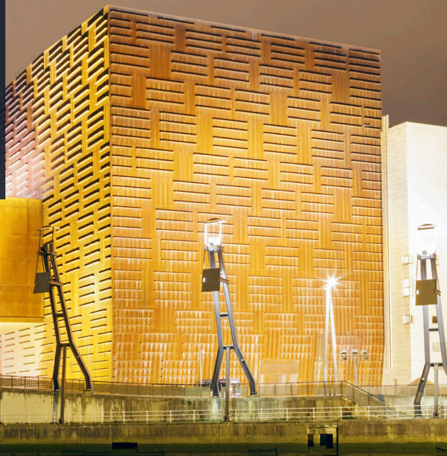
▲ EUSKALDUNA CONFERENCE CENTRE

Its magnificent setting and its extensive range of services make Bilbao (Euskadi) one of Europe's most attractive cities for conferences, trade fairs and incentive travel. The surrounding green countryside with splendid forests and mountains provide endless opportunities for active leisure.