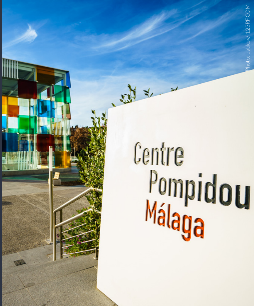
▲ POMPIDOU CENTRE MÁLAGA