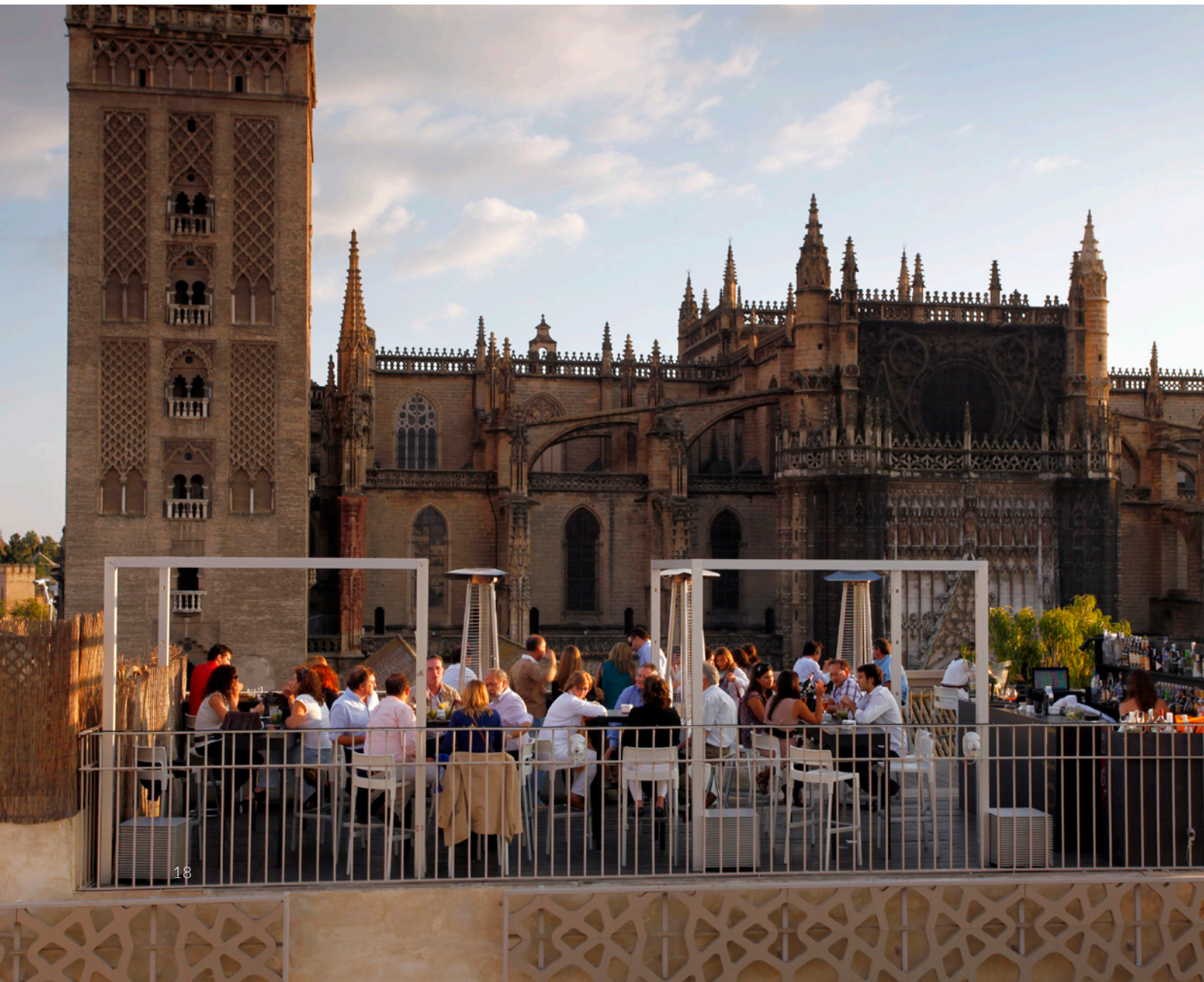
▼ TERRACE WITH VIEWS OF THE CATHEDRAL

① Further information: www.sevillacb.com