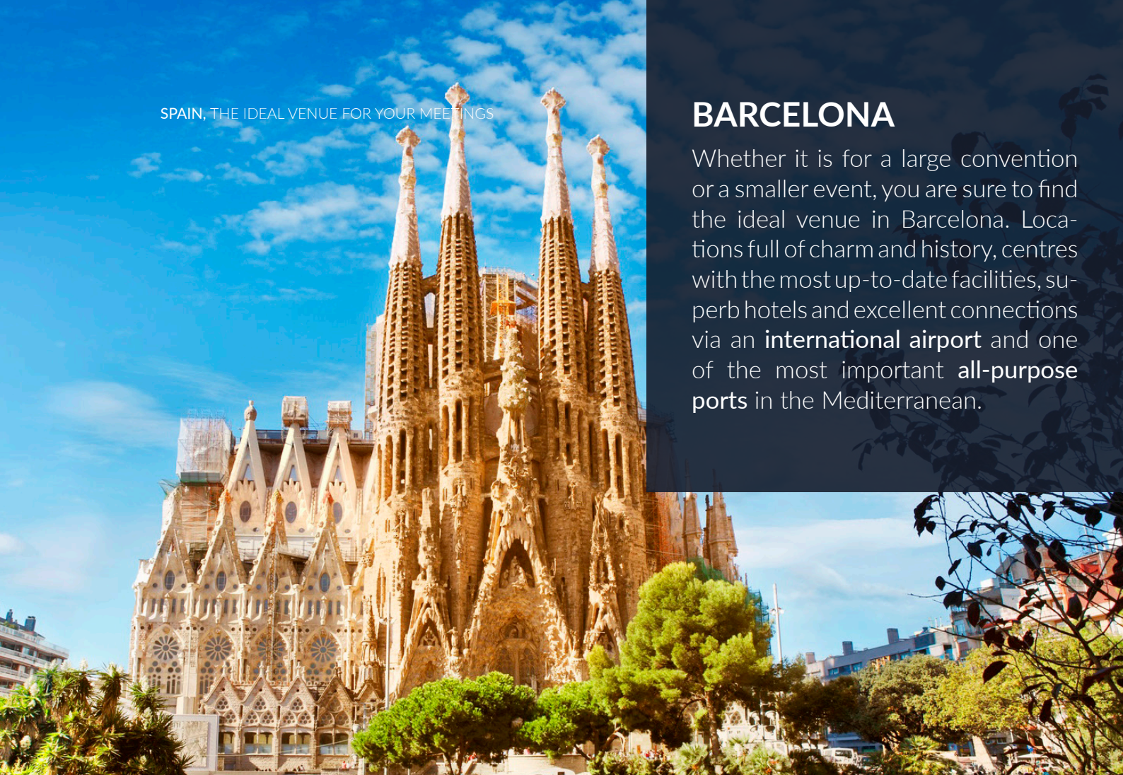
▲ THE BASILICA OF LA SAGRADA FAMILIA

Whether it is for a large convention or a smaller event, you are sure to find the ideal venue in Barcelona. Locations full of charm and history, centres with the most up-to-date facilities, superb hotels and excellent connections via an international airport and one of the most important all-purpose ports in the Mediterranean.