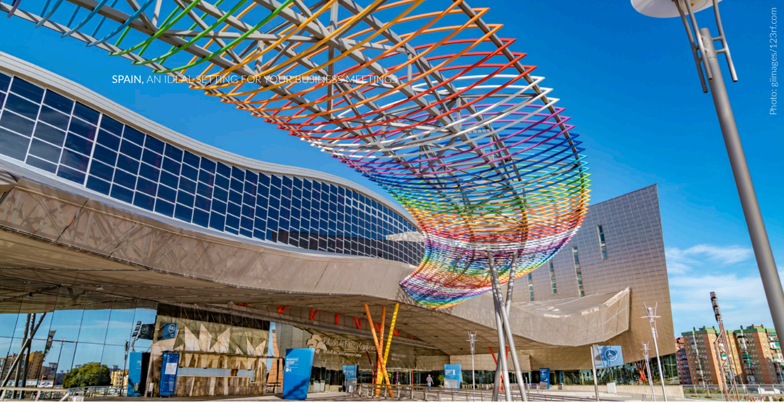
▲ CONFERENCE AND EXHIBITION CENTRE