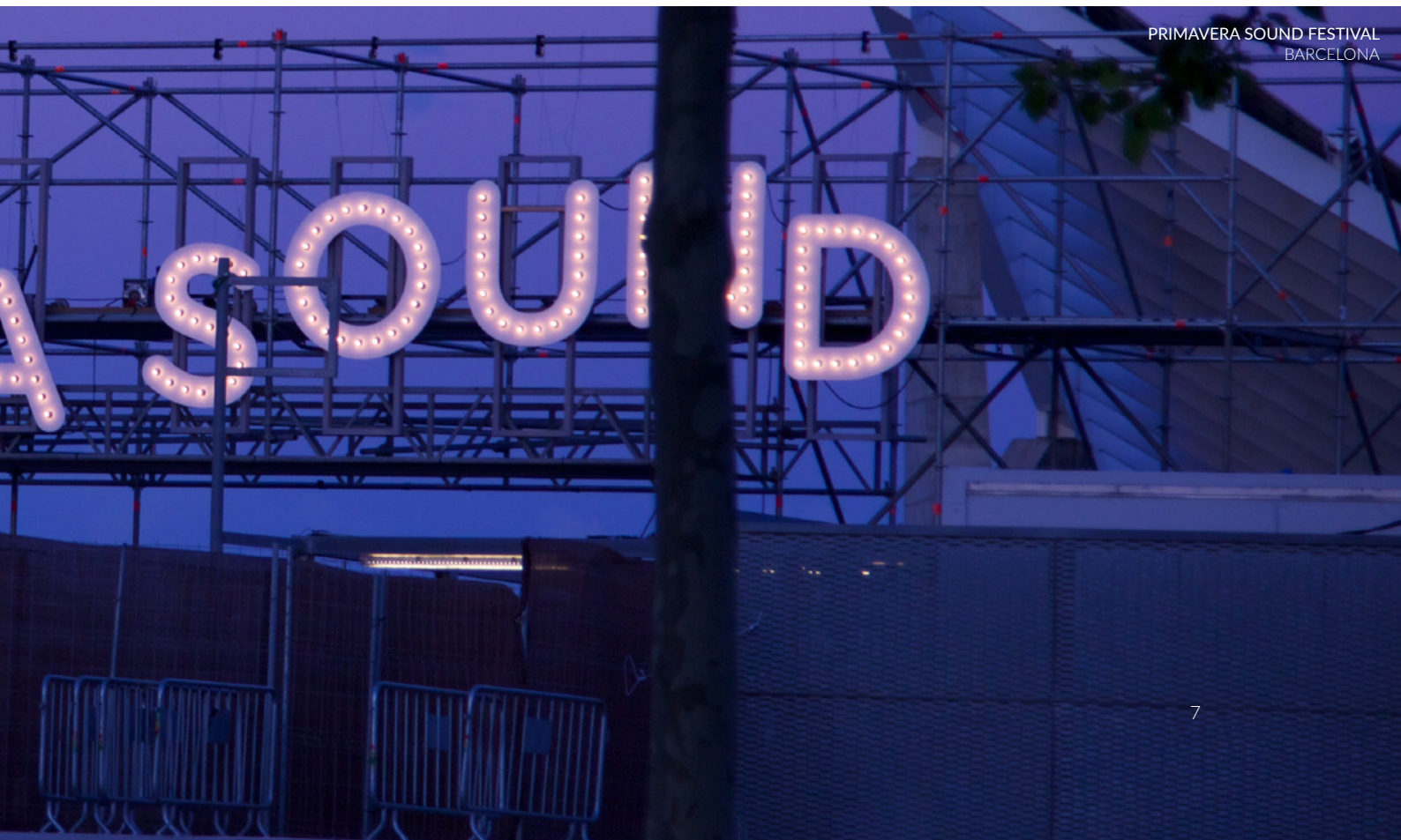
PRIMAVERA SOUND FESTIVAL BARCELONA