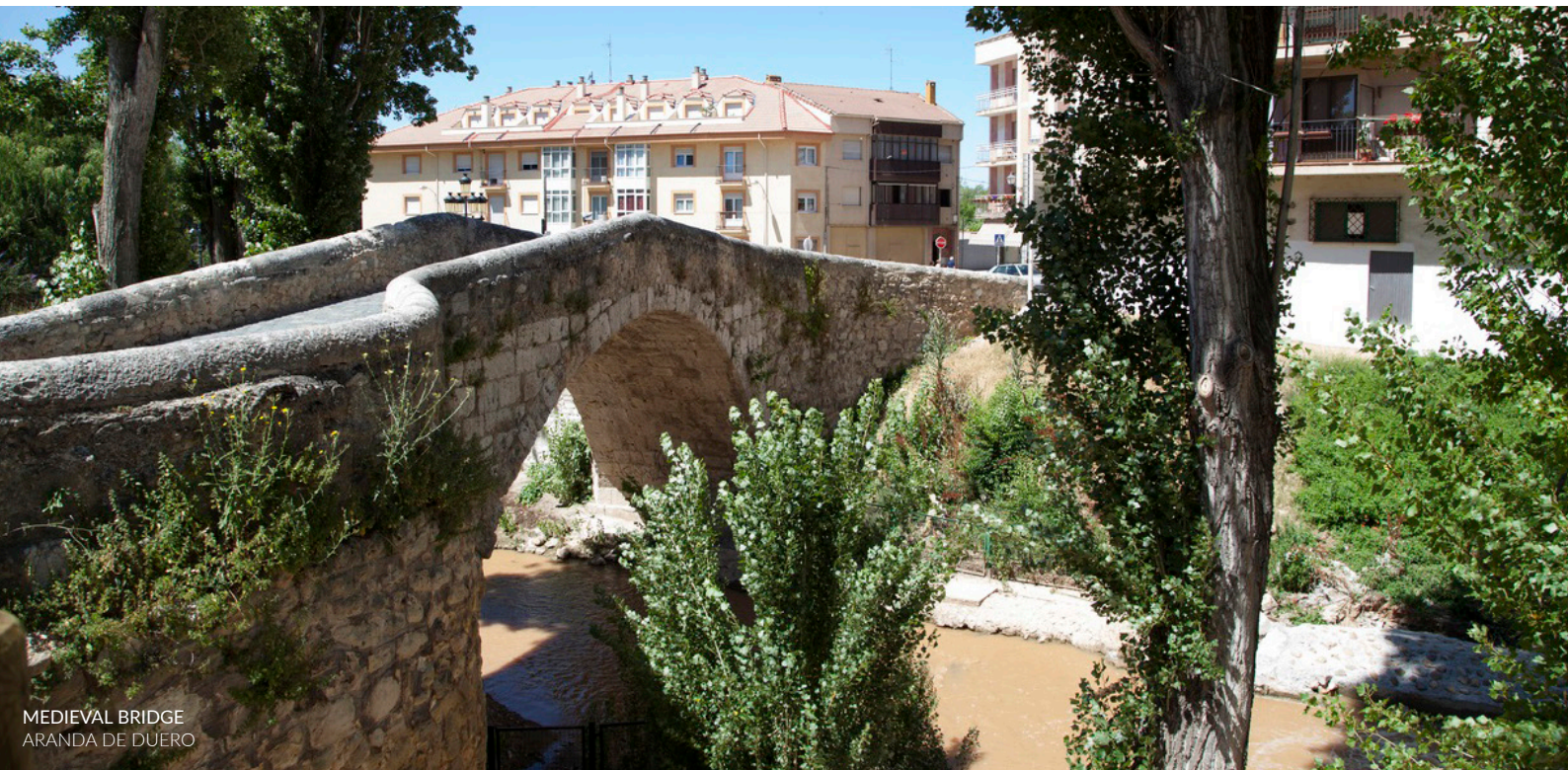
MEDIEVAL BRIDGE ARANDA DE DUERO

Recent editions have seen the addition of new sections, like Latin-American music which takes place in the La Isla Park , and 60s music in the Plaza Arco Pajarito .