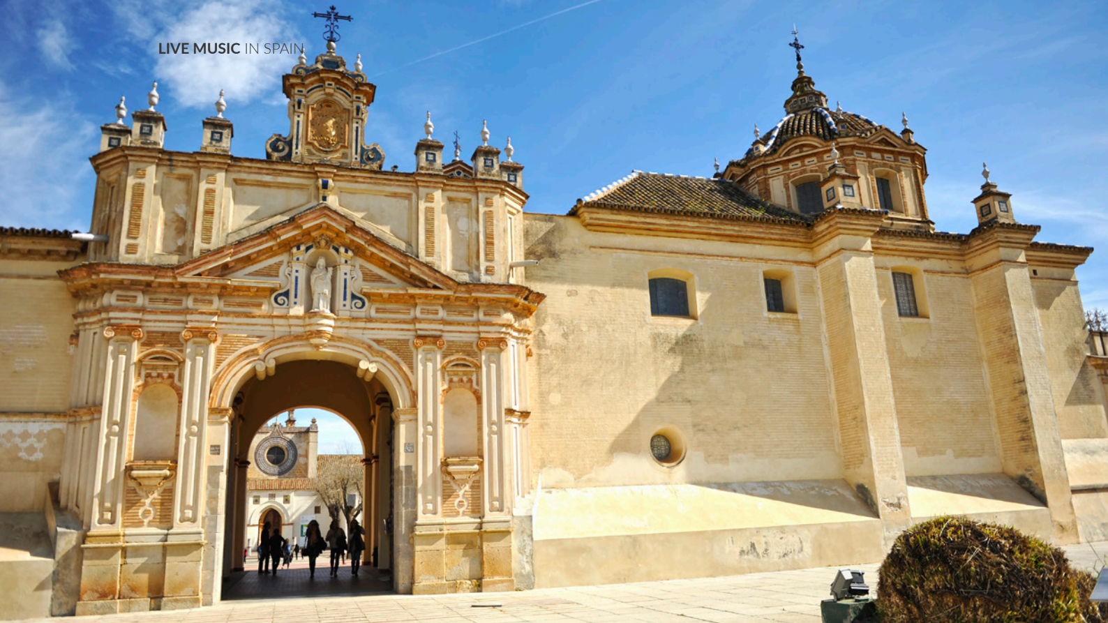
▲ ANDALUSIA CONTEMPORARY ART CENTRE (CAAC) SEVILLE