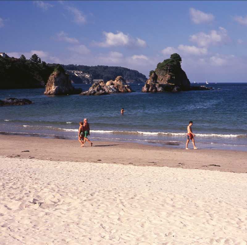
▲ PLAYA DE COVAS - OS CASTELOS VIVEIRO, LUGO

Four days, four stages and 100 bands playing hard rock, hardcore, punk, and heavy metal in all its versions. This is the Resurrection Fest in a nutshell and which takes place in mid-July in amazing natural surroundings in the fishing village of Viveiro (Lugo).