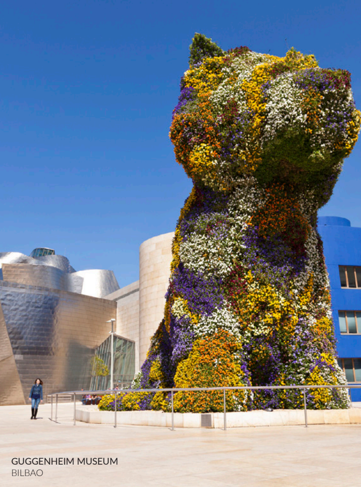
GUGGENHEIM MUSEUM BILBAO

Apart from the incredible line-up each year, one of the best features is the venue itself, Kobetamendi . The location is ideal, on one of the hills surrounding the city and in a small forest, called Basoa in the Basque language, you'll find the area dedicated to DJs . Then there are three big stages and a marquee where you'll get the best pop, rock and electronic music on the planet.