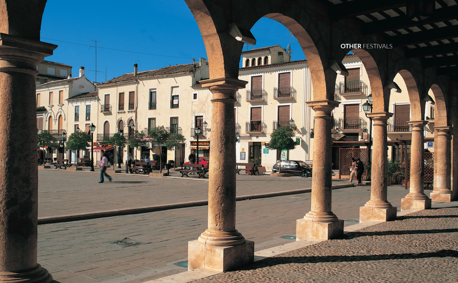
▲ PLAZA MAYOR VILLARROBLEDO, ALBACETE