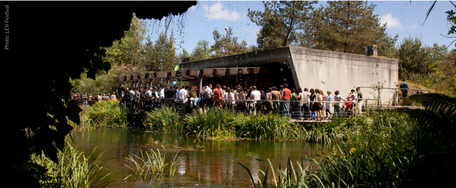
▲ L.E.V. FESTIVAL GIJÓN

Other parts of the city are also used as special venues, like the Botanical Gardens and several museums, creating a circuit providing unique experiences with the presentation of interesting, avant-garde international audiovisual art.