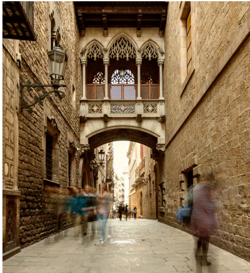
▲ GOTHIC QUARTER BARCELONA

While you're here, it's so easy to take advantage of everything that Barcelona has to offer, the location of Sónar de Día near the city centre makes everything so accessible. The capital of Catalonia is the epitome of a modernist city. Here you can see the foremost architectural treasures designed by Antoni Gaudí, like the Sagrada Família and Güell Park . There are also Roman remains and medieval neighbourhoods like the