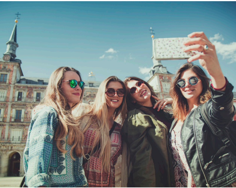
▲ PLAZA MAYOR MADRID