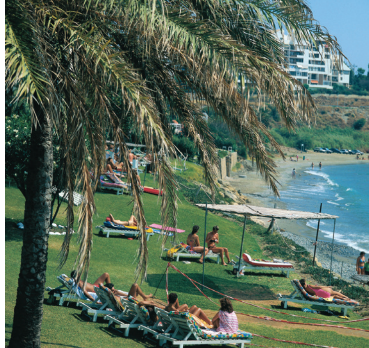
▲ PLAYA DE ESTEPONA MÁLAGA

There are food trucks, bars and a rest area. There are also water spray systems and fountains throughout the enclosure to help when the weather