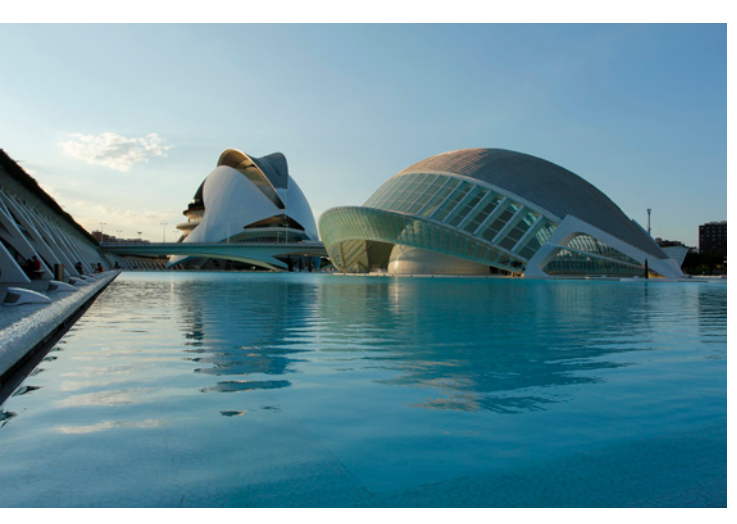
CITY OF ARTS AND SCIENCES VALENCIA

Valencia, a city full of contrasts and the essence of all that is Mediterranean. Visit the historical old town as well as the amazing avant-garde buildings in the city. You'll be amazed by the City of Arts and Sciences, one of the largest scientific and cultural complexes in Europe.