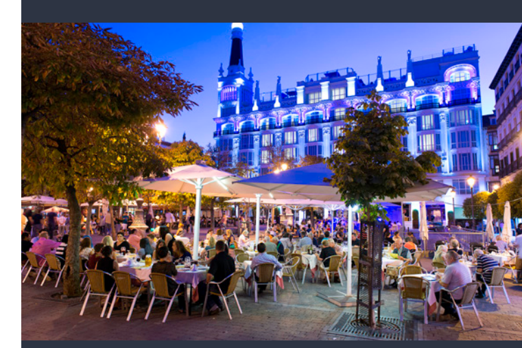
PLAZA DE SANTA ANA MADRID