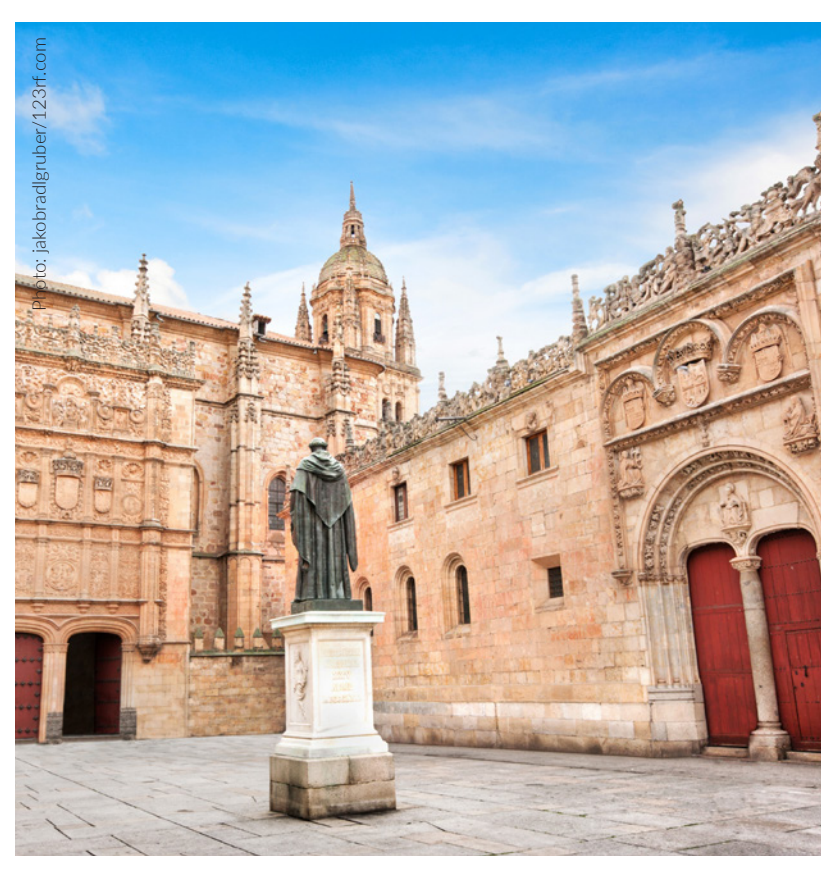
UNIVERSIDAD DE SALAMANCA

The Universidad de Salamanca , the oldest in Spain, has the longest tradition and highest prestige when it comes to the teaching of Spanish.