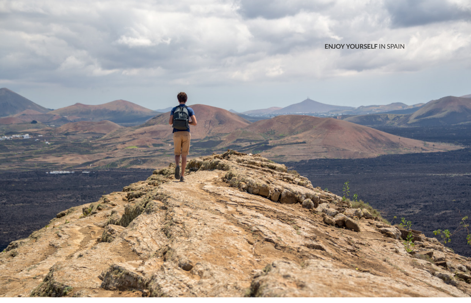
TIMANFAYA NATIONAL PARK LANZAROTE