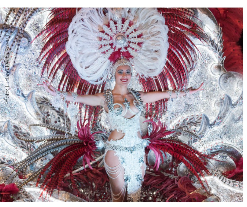
CARNIVAL IN TENERIFE

In Spain you'll find popular festivities at any time of the year. Come and experience all the enjoyment of Spain through its festivities.