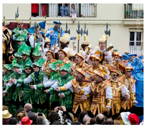
CARNIVAL IN CÁDIZ

During Las Fallas in Valencia, the whole city is devoted to its festival and the music. For a whole week the city is filled with "ninots" (gigantic structures made of wood, cardboard and plaster, all based on socially critical humour) which end up as spectacular bonfires.