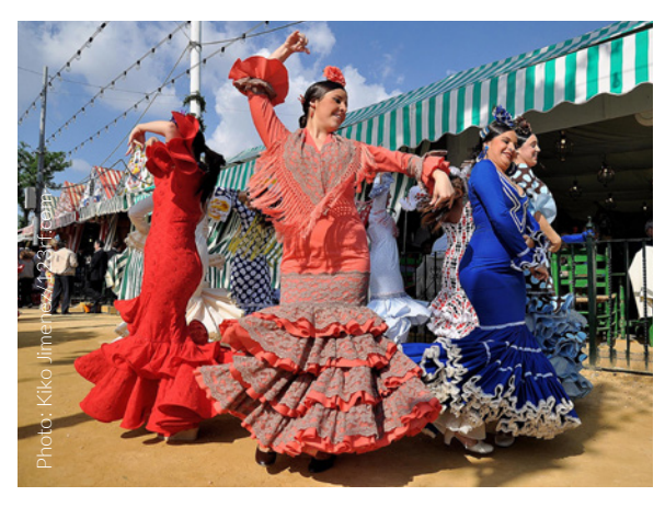
APRIL FAIR SEVILLE

Seville during the April Fair is synonymous with fun at all hours. The fairground and the marquees fill with music, laughter, food, and glasses of dry sherry or "rebujito" (manzanilla wine with fizzy lemonade). Don't go without trying the typical "pescaíto frito" (fried fish platter) and make sure you get to see the spectacular parade of horses and horse-drawn carriages.