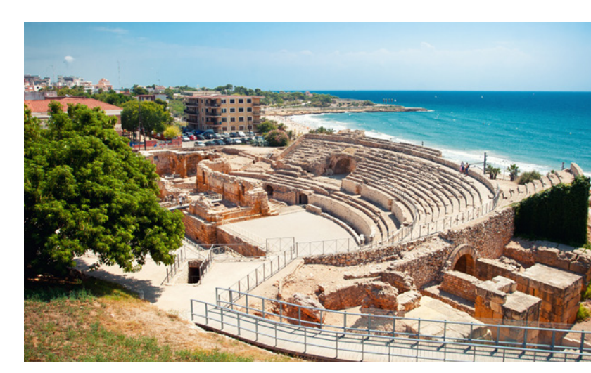
ROMAN AMPHITHEATRE TARRAGONA

The Roman presence in Spain lasted over six centuries, so it is easy to find remains of their legacy practically anywhere in the country. There are especially significant archaeological remains in Tarragona and in Sagunto (Valencia) which preserve gems from their Roman past like forums, amphitheatres and theatres. Segovia is home to a prodigious feat of engineering, the Roman aqueduct, one of the best preserved in Europe.