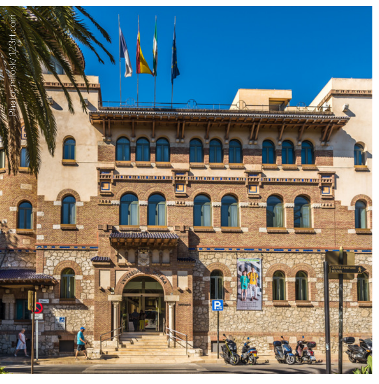
UNIVERSIDAD DE MÁLAGA