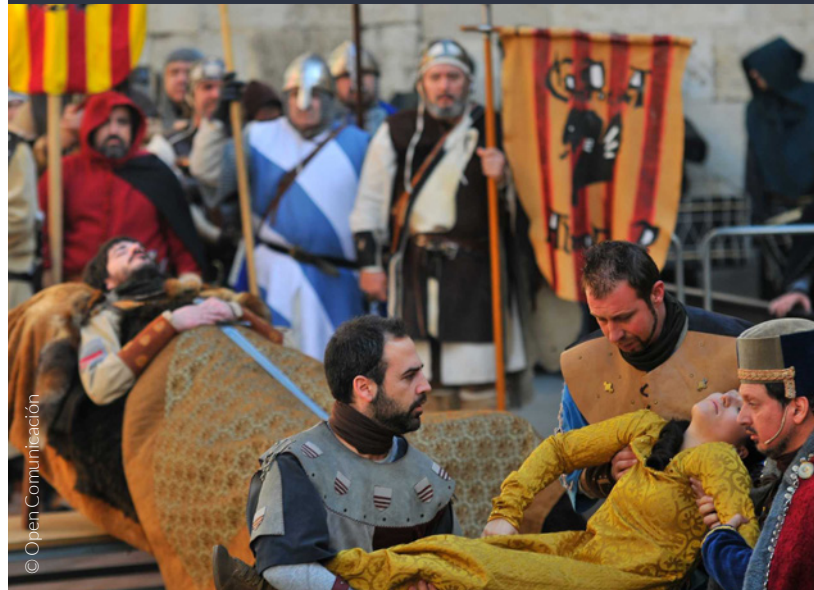
▲ FESTIVAL OF LAS BODAS DE ISABEL DE SEGURA TERUEL