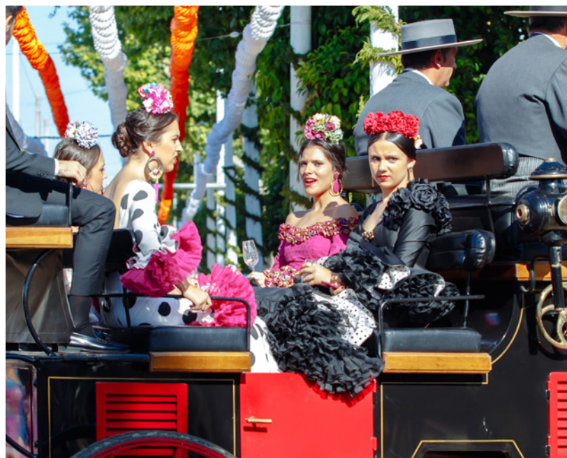
▲ APRIL FAIR SEVILLE

📍 Where: Seville (Andalusia) When: April www.visitasevilla.es