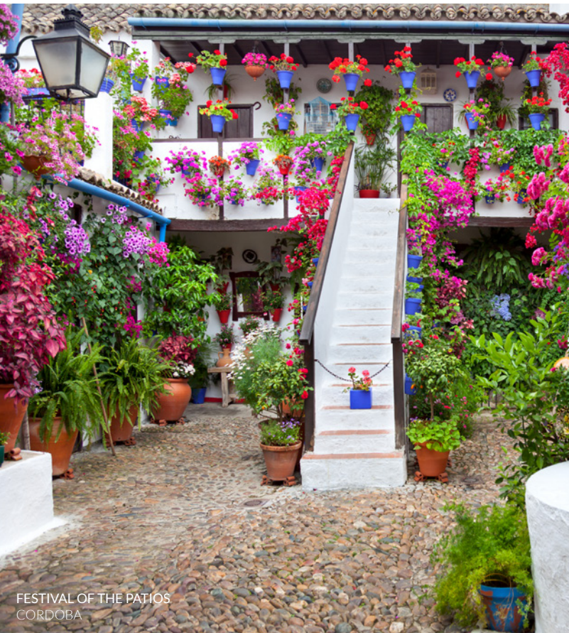
FESTIVAL OF THE PATIOS CORDOBA