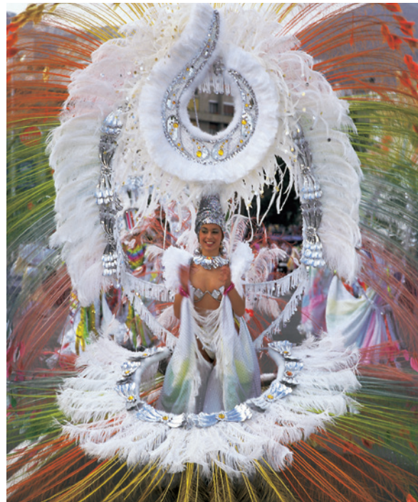
▲ CARNIVAL SANTA CRUZ DE TENERIFE

The Carnival in Santa Cruz de Tenerife stands out because it is so spectacular. The people in Tenerife spend the whole year getting ready for their most important festival, designing the floats and getting their costumes ready. The choice of the Carnival Queen attracts international attention. The candidates parade in spectacular costumes some of which may weigh up to 200 kilos.