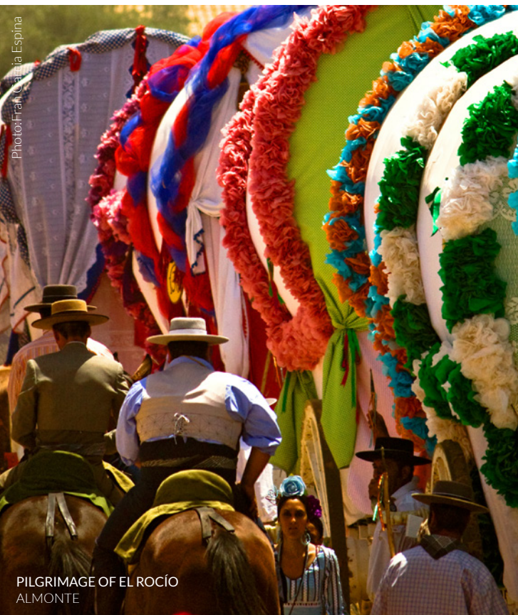
PILGRIMAGE OF EL ROCÍO ALMONTE

📍 Where: Almonte (Huelva, Andalusia) When: May www.andalucia.org