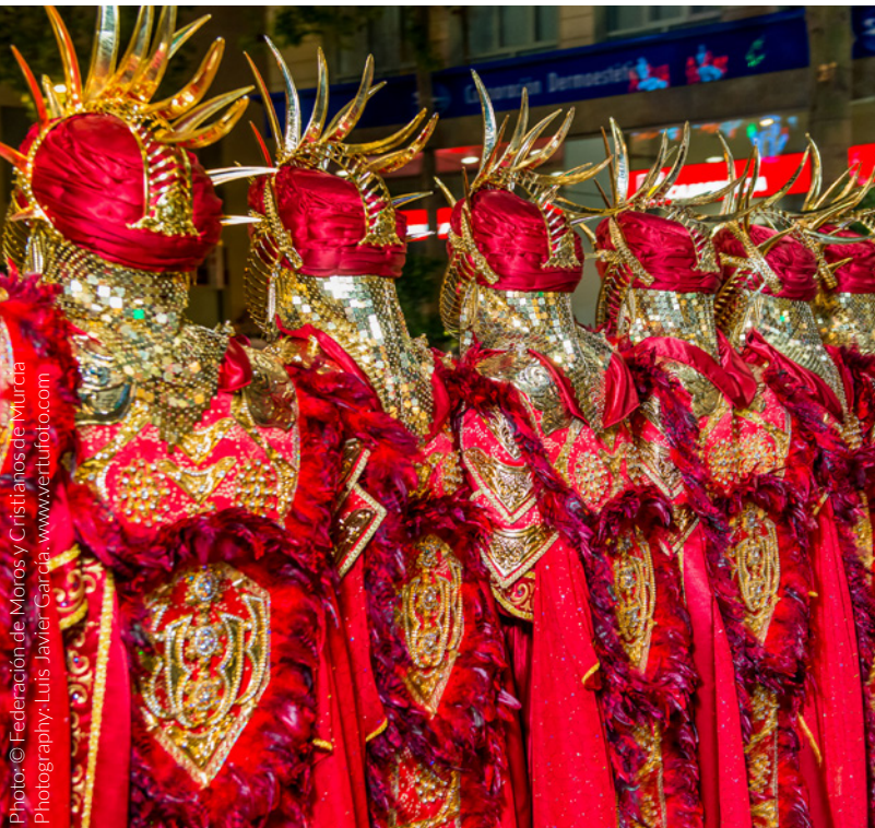
▼ MOORS AND CHRISTIANS MURCIA