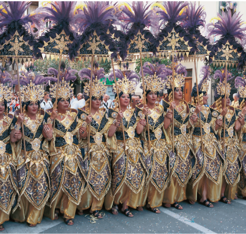
▲ MOORS AND CHRISTIANS VILLENNA, ALICANTE