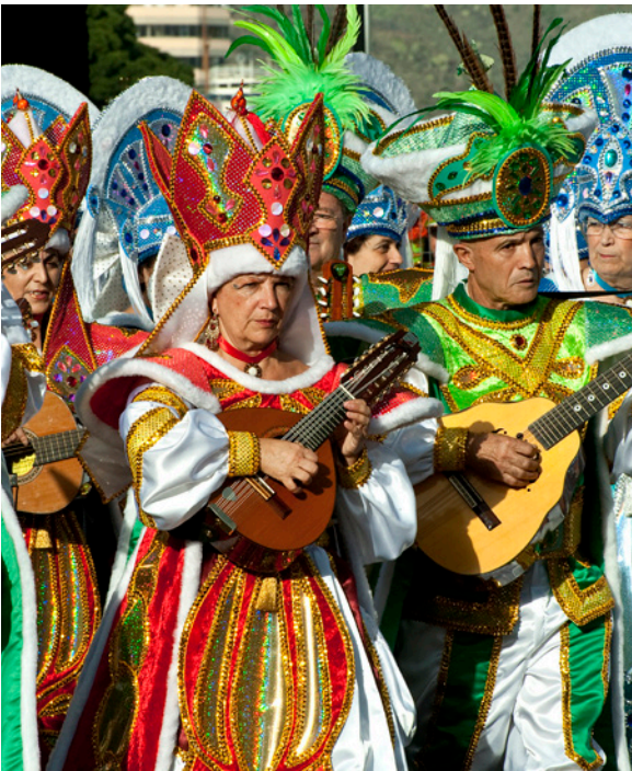
▲ CARNIVAL SANTA CRUZ DE TENERIFE