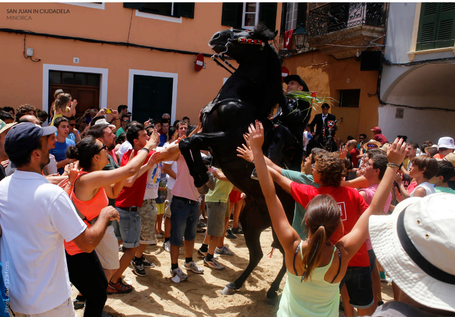
SAN JUAN IN CIUDADELA MINORCA