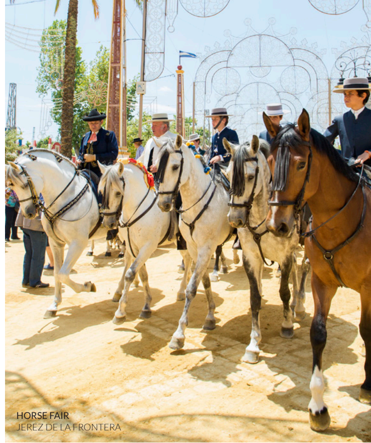
HORSE FAIR JEREZ DE LA FRONTERA