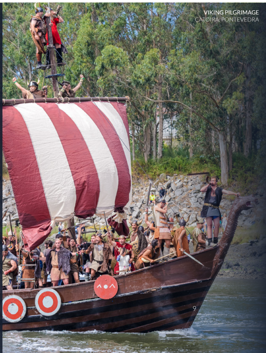
VIKING PILGRIMAGE CATOIRA, PONTEVEDRA

📍 Where: Catoira (Pontevedra, Galicia) When: first Sunday in August