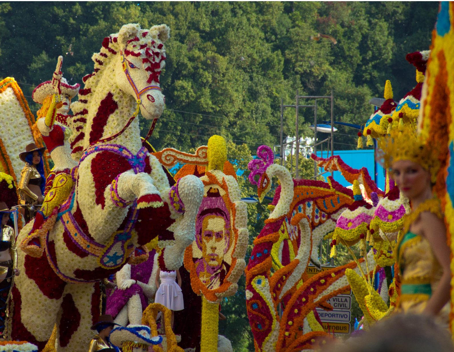
▲ BATTLE OF THE FLOWERS LAREDO