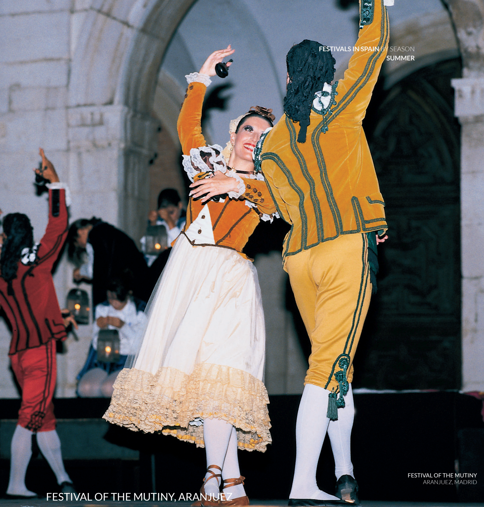
FESTIVAL OF THE MUTINY ARANJUEZ, MADRID