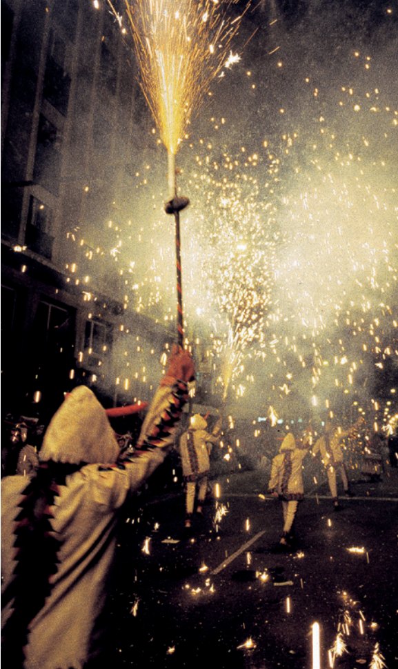
▲ BURIAL OF THE SARDINE MURCIA