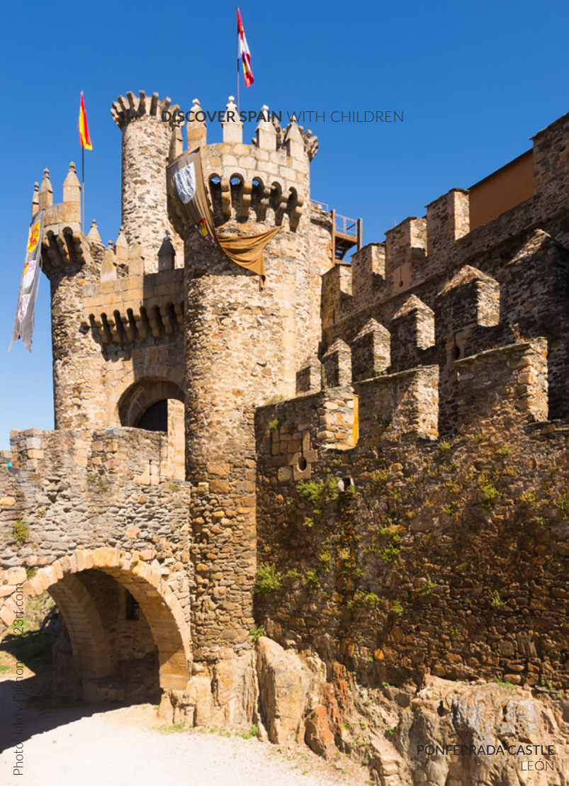
PONFERRADA CASTLE LEÓN