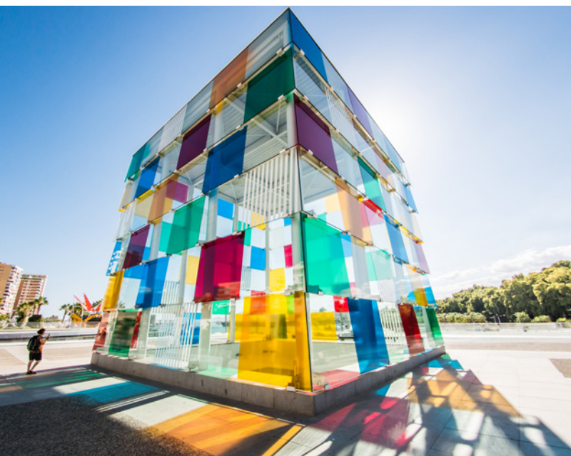
▲ POMPIDOU CENTRE IN MÁLAGA

The Bioparc , a new generation zoo, and the City of Arts and Sciences are two visits you really shouldn't miss. For those looking for something more unusual, you have the L'Iber Museum , which has an incredible collection of tin soldiers, and the Natural Science Museum .