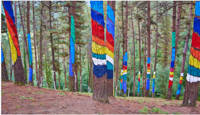
▲ ENCHANTED FOREST OF OMA VIZCAYA

Discover the north of Spain while enjoying natural landscapes of exceptional beauty along the Way of Saint James. The end of the French Route, the most popular, starts in Sarria which is already in Galicia . Divided into six or seven stages, it is the most suitable route for families with children from the age of 10. It is advisable to book your hostel accommodation in advance and