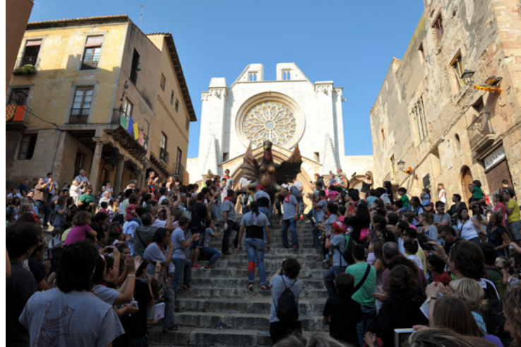
▲ SANTA TECLA CATHEDRAL TARRAGONA