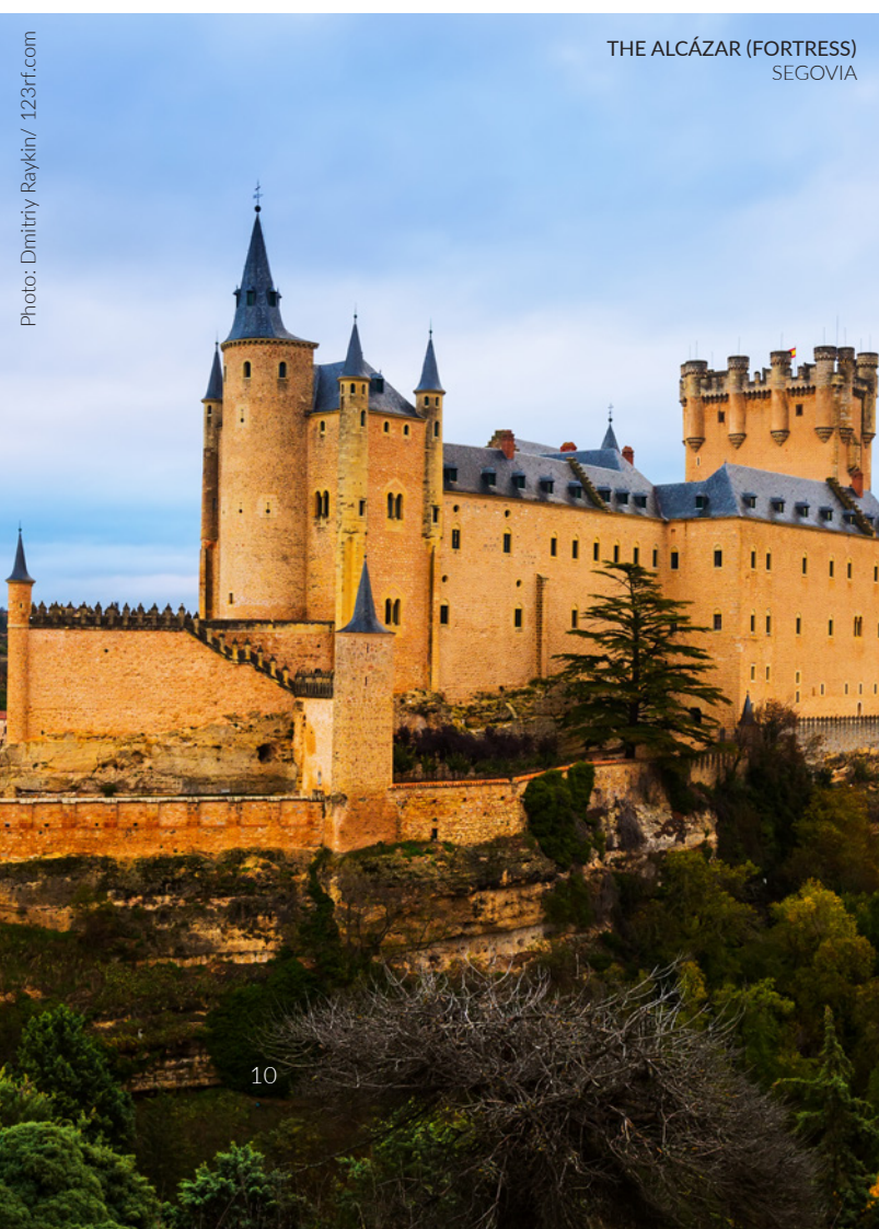
THE ALCÁZAR (FORTRESS) SEGOVIA