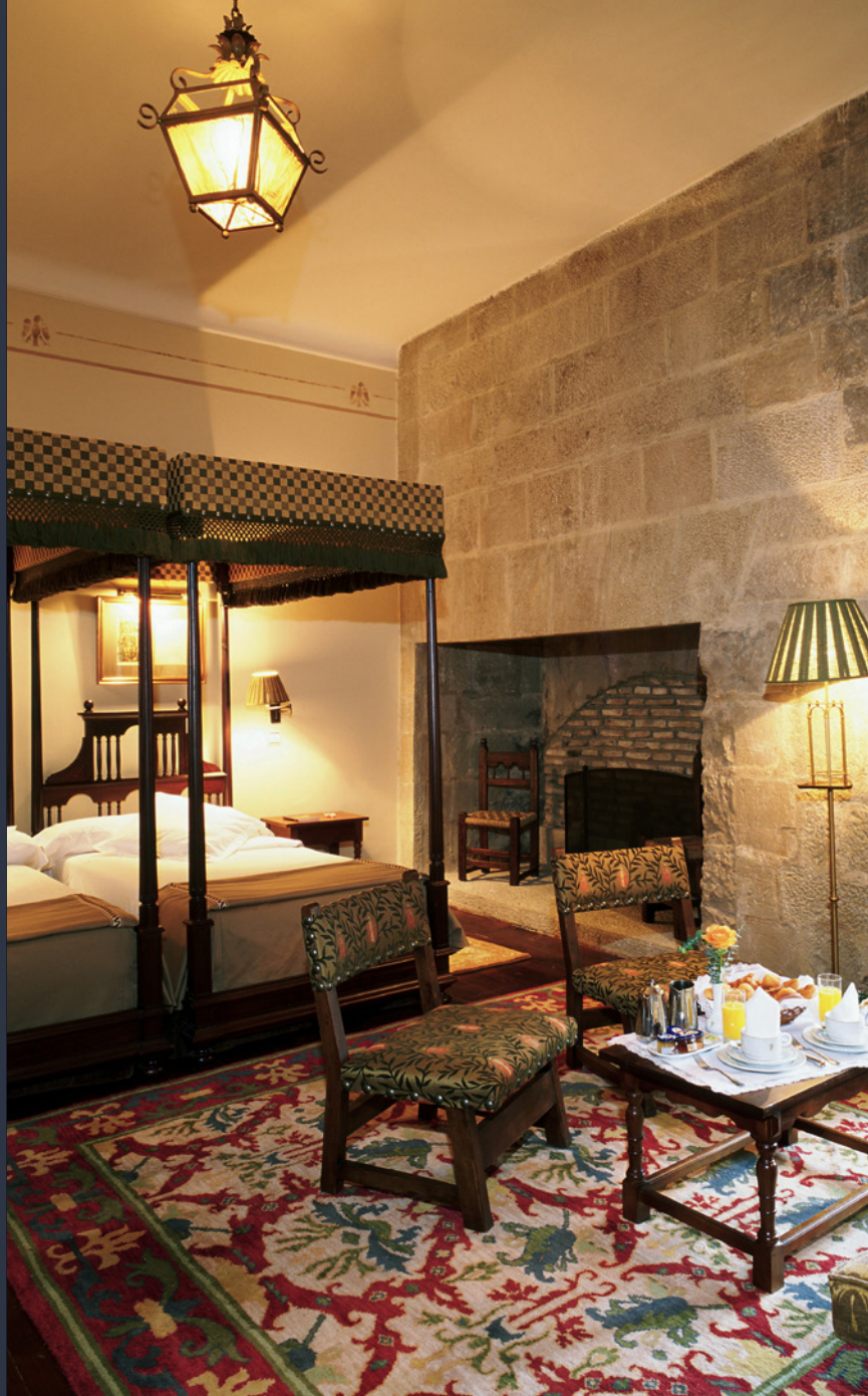
▲ OLITE PARADOR HOTEL NAVARRE

A country house is a fantastic option for enjoying nature with your family. These are often older buildings (farmsteads, mansions, farm houses, farm workers' cottages and mills) which have been refurbished as tourist accommodation with all modern comforts. There you can sleep in incredible natural surroundings and enjoy first-class cuisine. Many of them have their own children's play parks and organise numerous activities for all ages, like walks and excursions by bicycle or on horseback. They are usually located in small towns and villages or outside the built-up areas of the larger cities.