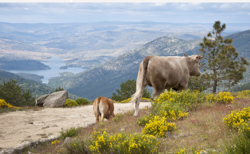
▲ IRUELAS VALLEY NATURE RESERVE ÁVILA