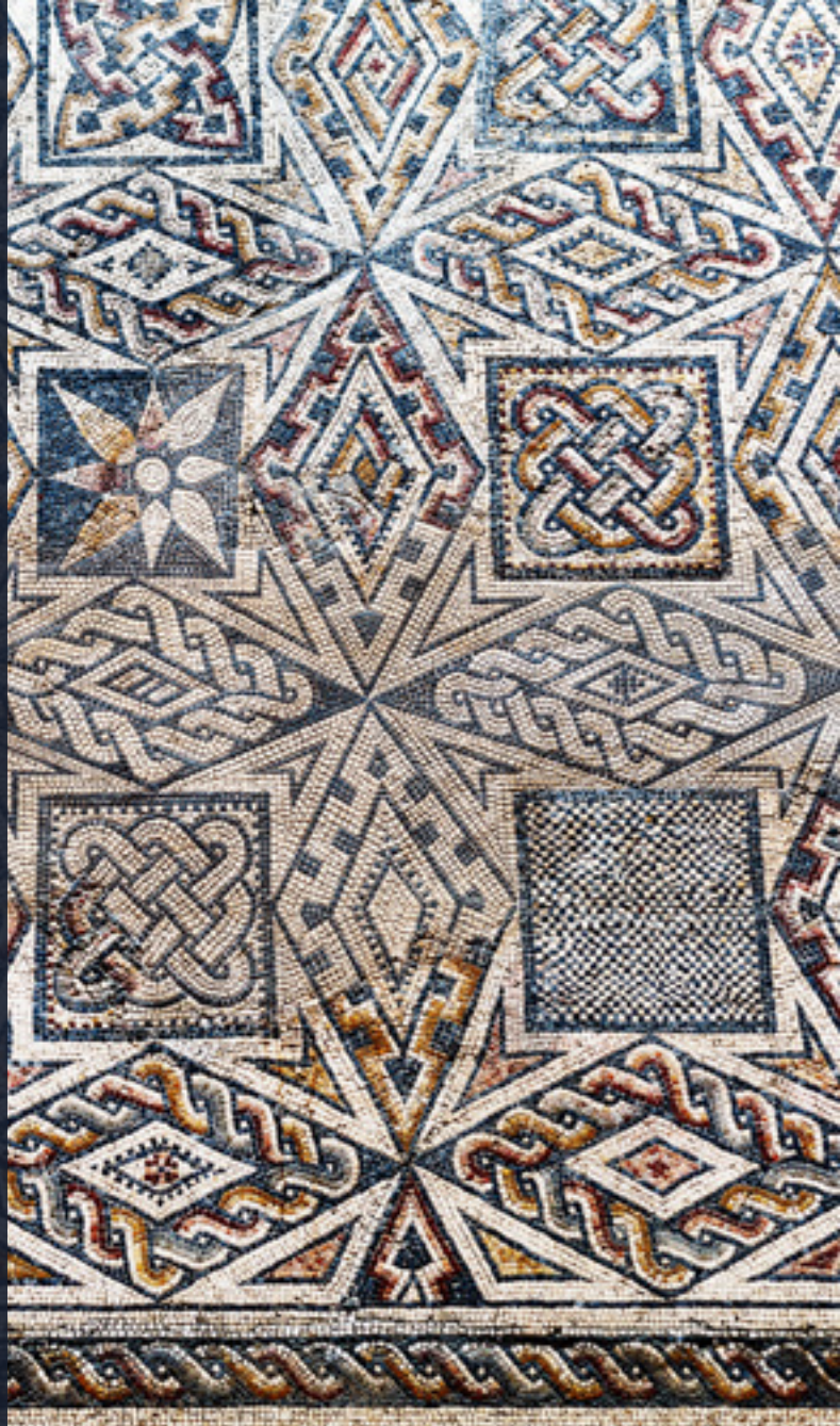
▲ ROMAN MOSAIC NATIONAL MUSEUM OF ROMAN ART (MÉRIDA)

In Extremadura you'll see cornfields, vineyards and pastures. You'll be astonished by the historic quarter in Cáceres and the Merida archaeological complex, both designated as World Heritage sites by the UNESCO. The province of Cáceres awaits you with the picturesque town of Hervás , renowned for its Jewish quarter with steep, narrow streets, and Plasencia , which features a monumental complex with two cathedrals and a number of palaces and stately houses. The Iberian cured ham is delicious in Extremadura, one of the best in the country, and the Roman spa of Baños de Montemayor is a perfect place for you to relax.