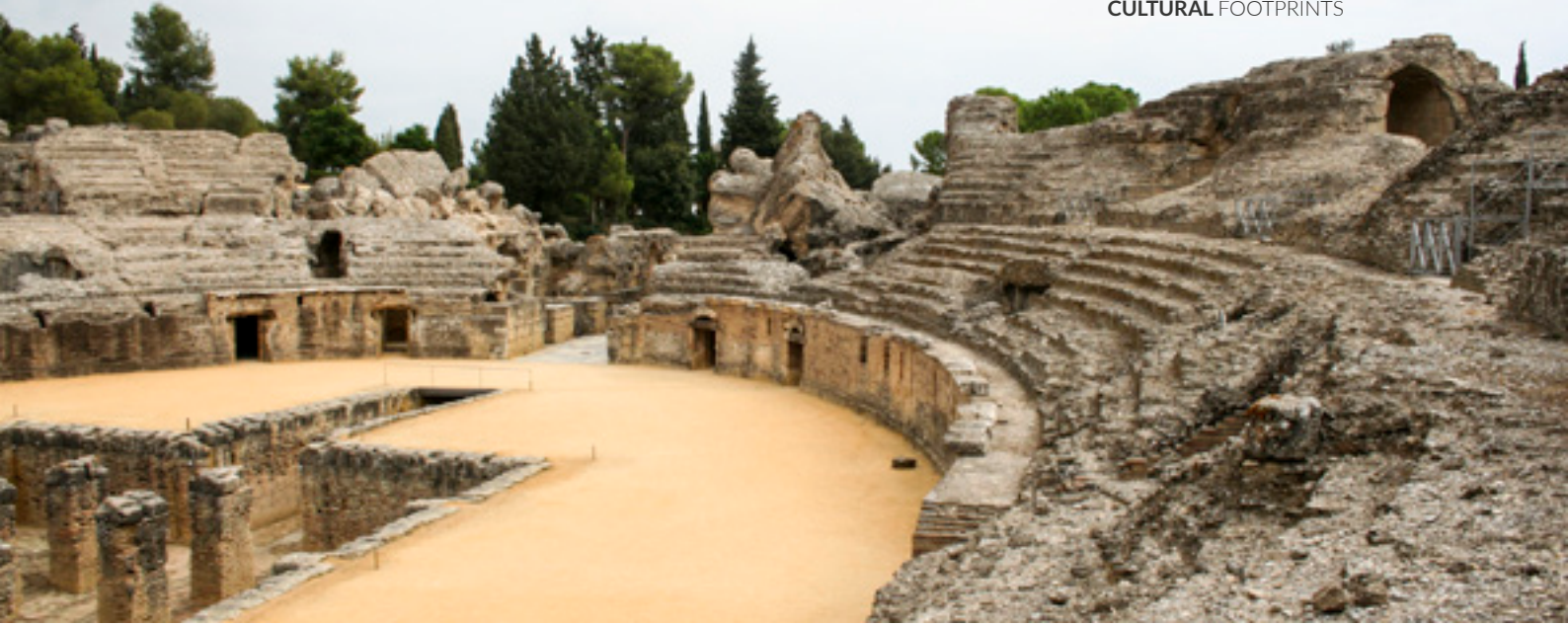
▲ ROMAN AMPHITHEATRE IN ITÁLICA SANTIPONCE (SEVILLE)

On the Route of the Almoravids and Almohads you'll discover the architectural heritage of this civilisation which consists mainly of castles and defensive structures. You'll travel 400 kilometres, starting in the city of Algeciras (Cádiz) and ending in Granada , including the two branches. The itinerary includes visits to Jerez de la Frontera (Cádiz) and Ronda (Málaga).