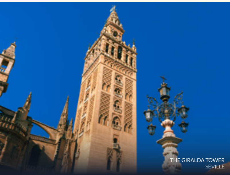
THE GIRALDA TOWER SEVILLE

The route also includes picturesque towns and villages in the province of Seville like Carmona , Marchena and Écija ; and in Granada, like Alhama de Granada .