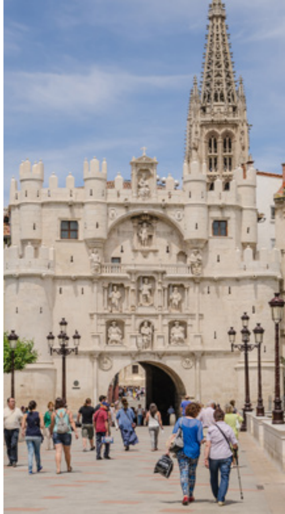
▲ SANTA MARÍA ARCHWAY BURGOS

The next stop is in Castile-León. Visit the Medieval Medina de Pomar (Burgos), where Charles V spent the night, and the Velasco Fortress , an impressive 14th century castle. On arriving in the monumental city of Burgos you pass through the Santa María Archway , one of the ancient gateways to the