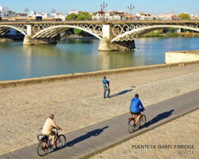
PUENTE DE ISABEL II BRIDGE SEVILLE