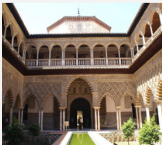
▲ PATIO DE LAS DONCELLAS IN THE REAL ALCAZAR IN SEVILLE SEVILLE

Belmonte Castle in Cuenca is a treasure from the Renaissance. It is in the shape of a six-pointed star with a cylindrical tower at each point. If you visit it in May/June, you'll be able to witness a historical recreation of Medieval military life in the castle in all its aspects.