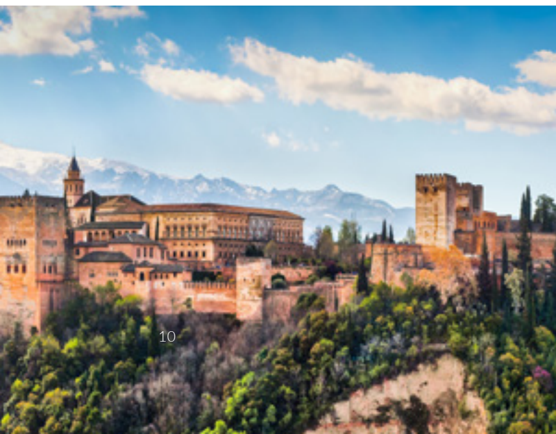
◀ THE ALHAMBRA GRANADA