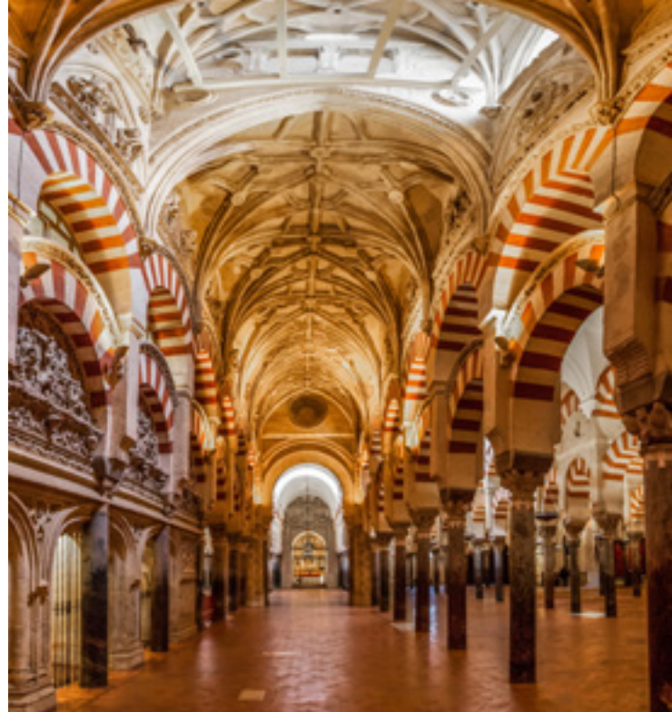
▲ GREAT MOSQUE-CATHEDRAL OF CORDOBA CÓRDOBA

In Segovia you can take a stroll through the delightfully restored Jewish quarter. Here you'll find the old Great Synagogue which has now become the Church of Corpus Christi , and the old Jewish cemetery .