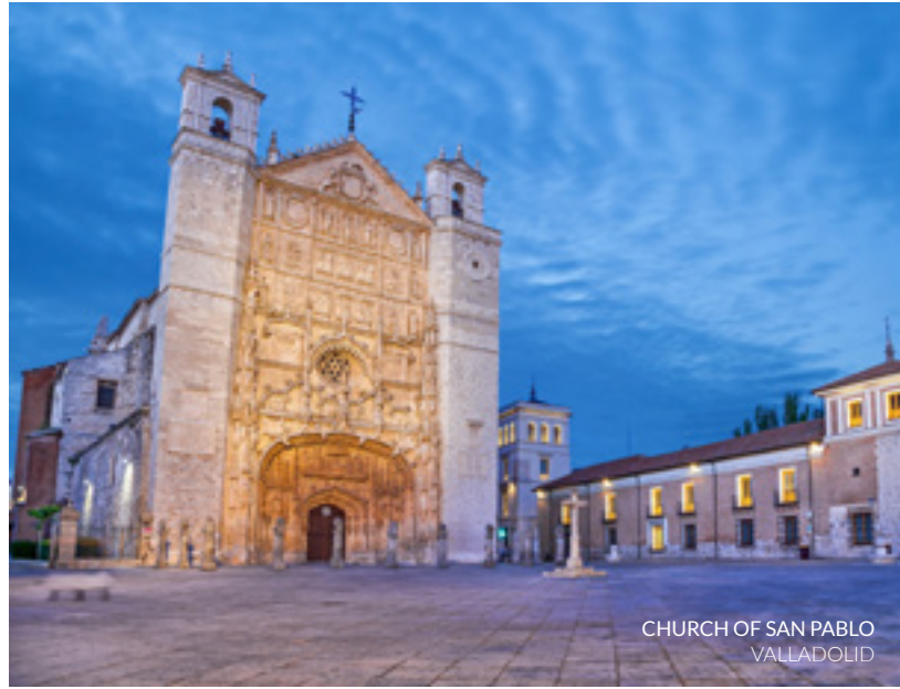
CHURCH OF SAN PABLO VALLADOLID