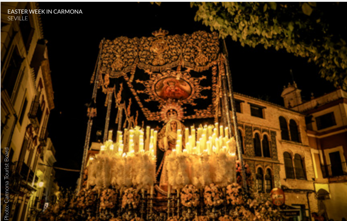
EASTER WEEK IN CARMONA SEVILLE