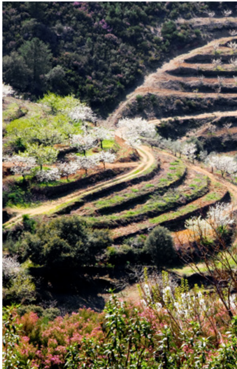
▼ THE EL JERTE VALLEY CÁCERES