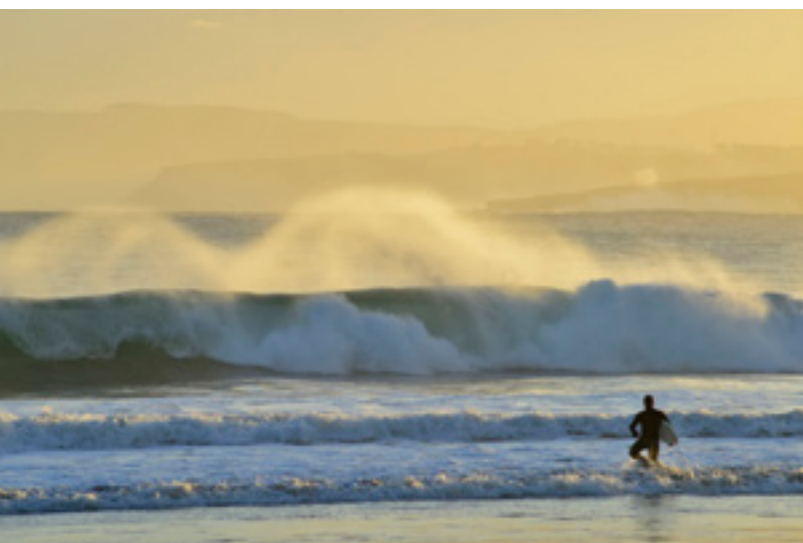
▲ LAREDO CANTABRIA

Follow in the footsteps of Charles V after he abdicated. The monarch arrived in the North of Spain coming from Brussels with more than 50 ships and journeyed through Cantabria , Castile-León and Extremadura before reaching his retreat in the Yuste Monastery .