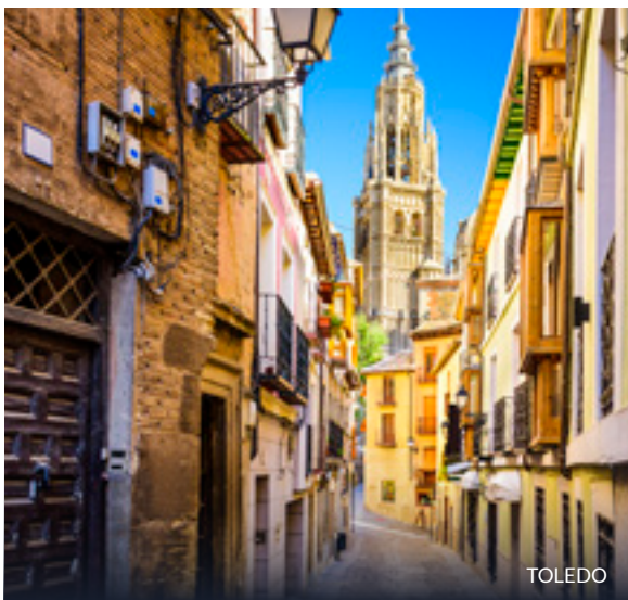
► SCULPTURE OF CERVANTES TOLEDO