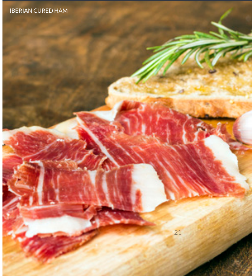
IBERIAN CURED HAM