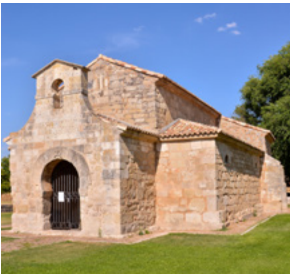
▲ CHURCH OF SAN JUAN DE BAÑOS VENTA DE BAÑOS (BURGOS)

On the last stage of the route, now in Extremadura , what you'll most enjoy are the natural surroundings. If you have the good fortune of travelling in springtime, you'll be able to enjoy the cherry blossom which is abundant in the Jerte Valley . The " Garganta de los Infiernos " (Devil's Gorge) Nature Reserve will really surprise you. Watch the golden eagles and griffon vultures flying overhead and marvel at the incredible glaciers. This route of the kings ends at the Yuste Monastery, next to which Charles V ordered the palace to be built where he lived until the end of his days.